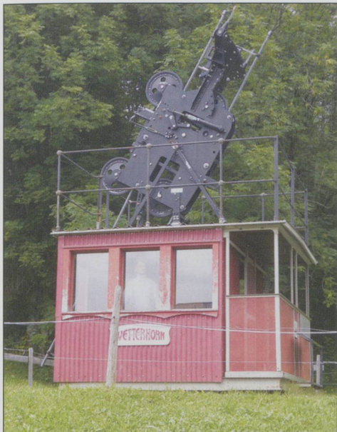
LEFT: The remains of the old steps to the glacier. ABOVE: An original Wetterhorn cable car with a forlorn passenger.