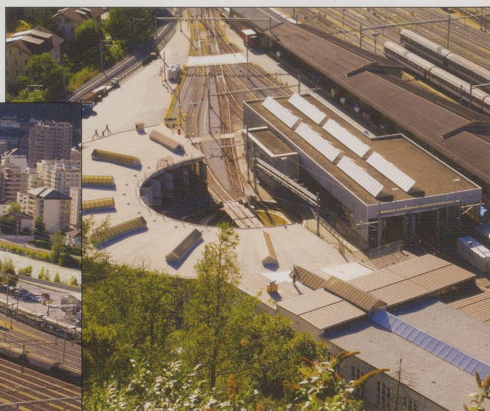
ABOVE: SBB Brig roundhouse & turntable seen from hillside behind depot on 9 September 2013.