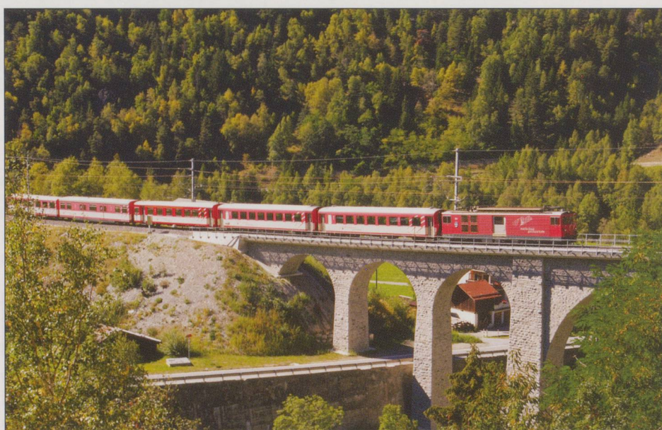
TOP: MGB Deh4/4II No. 94 east-bound approaching Grengiols bridge.