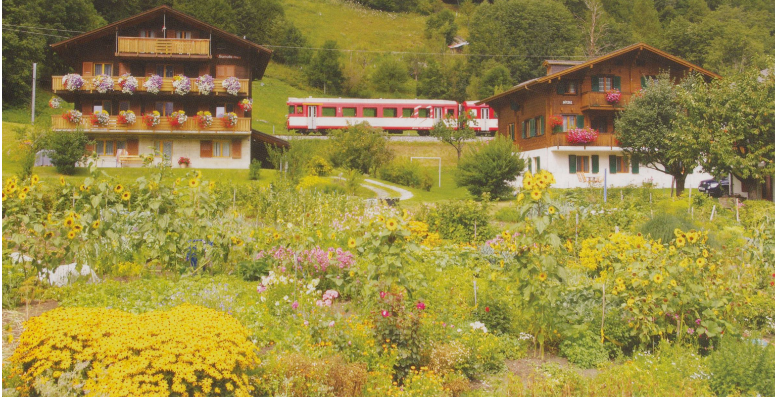
Westbound MGB train led by an unidentified ABt approaching Fiesch passing behind houses and gardens on the eastern side of the village. All photos Neil Wheelwright on 9 September 2013

H aving decided to stay in Brig for the weekend of the BLS Grosses BLS-Südrampenfest, and being able to make it a long weekend as I had a few days vacation left, the question was what to do on the Monday. As the weather forecast was good, I decided to do some lineside photography on the ex-FO section of the MGB. Having scoured Brig for a good walking map, and seen how many sections were almost inaccessible from walking paths, I headed for Fiesch with the aim of walking (downhill!) to Grengiols. My plan to travel the cable car up the Eggishorn was ruled out by low cloud which, while clearing over the valley, was stubbornly clinging to the mountains. After a coffee and a quick visit to a supermarket for the makings of lunch, I first headed eastwards only to find that the curve above the town was completely obscured by trees. However, I was able to get a shot of a train between two houses across a colourful garden. My route down to Lax confirmed the view I had from the morning's train journey, that the line was tucked too far into the side of the valley to be very visible. So, apart from some shots of the scenery along and across the valley, my next railway photographs were of local trains at Lax station where I also photographed a PostAuto on a service that calls there once each way per day – I'm sure there is a good reason!