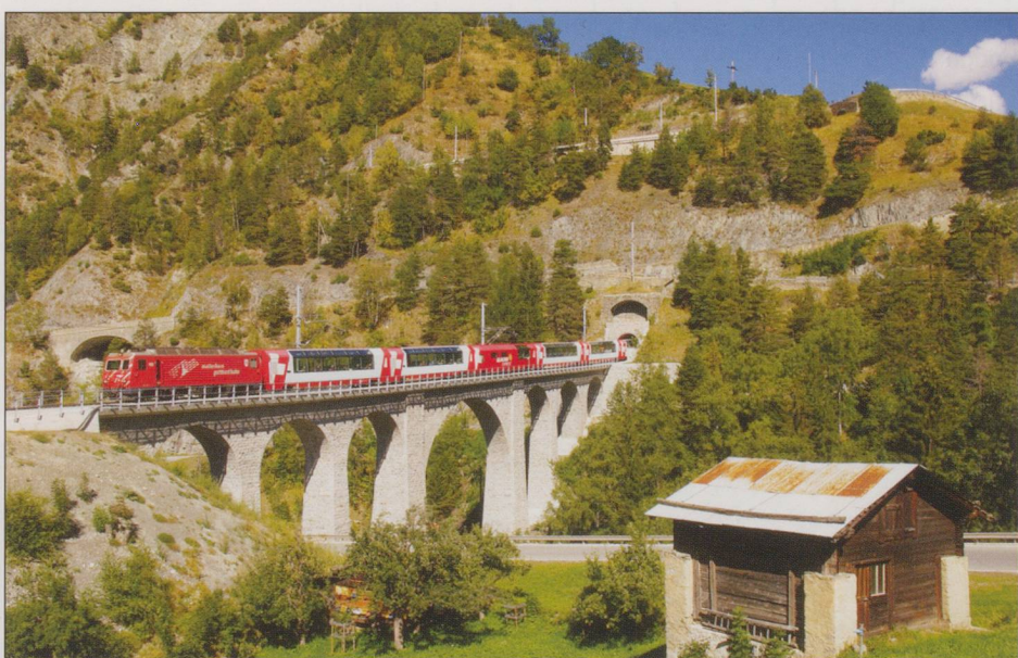
TOP: MGB Deh4/4II No. 93 with east-bound train on Grengiols river bridge - viewed from the hill above the bridge.