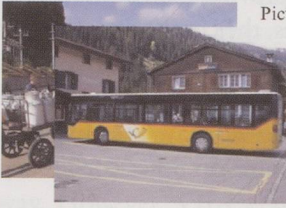
Pictures (and text) from Member A as digital files (scanned from slides or prints if necessary)