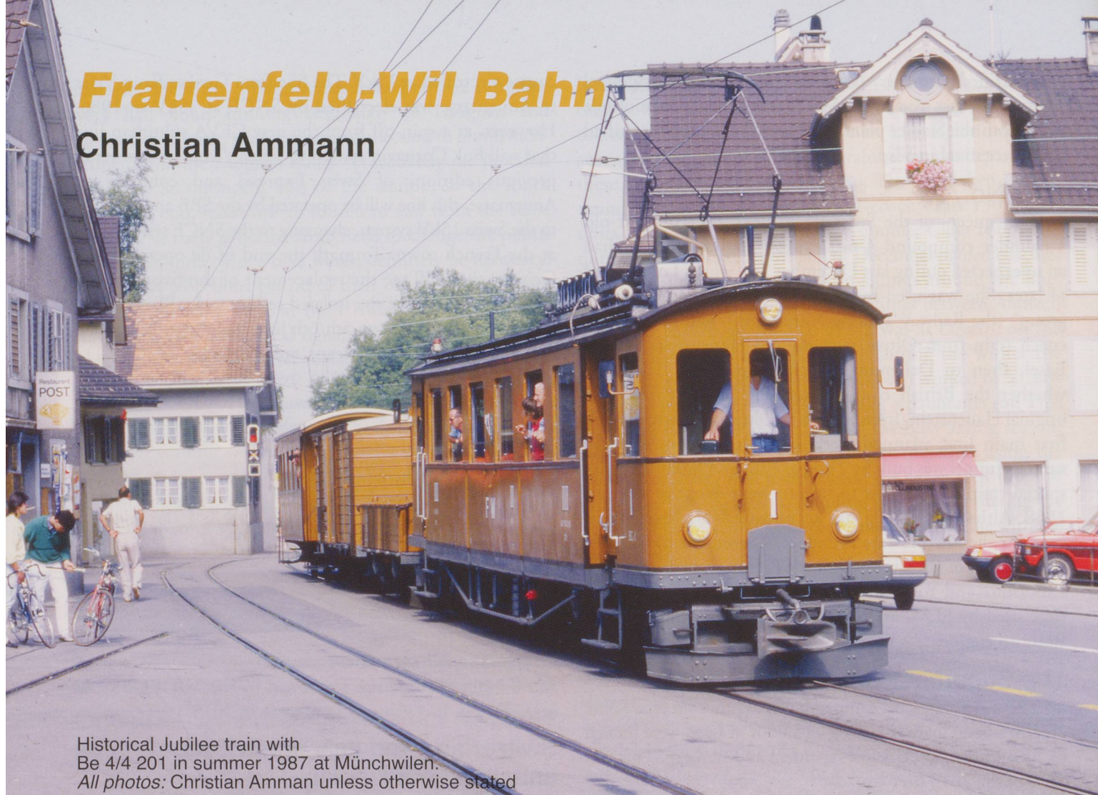
Historical Jubilee train with Be 4/4 201 in summer 1987 at Münchwilen.

In 2013, one year after its 125th anniversary, the Frauenfeld-Wil Bahn (FW, now marketed as the 'fwb'), acquired five new low-floor articulated 'DIAMANT' units from Stadler Rail. The arrival of these units marked another very important step in the modernisation of this 17.5km line. The investment programme was prepared after the 2006 decision by Kanton Thurgau to keep this metre-gauge railway as an efficient transport system serving the Murg Valley between Frauenfeld, the kantonal capital, and Wil a regional centre in Kanton St. Gallen.