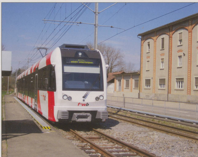
TOP: At Frauenfeld Marktplatz. MIDDLE: Test trip to Wängi GB LEFT: Test trip with 7001 at Rosental.