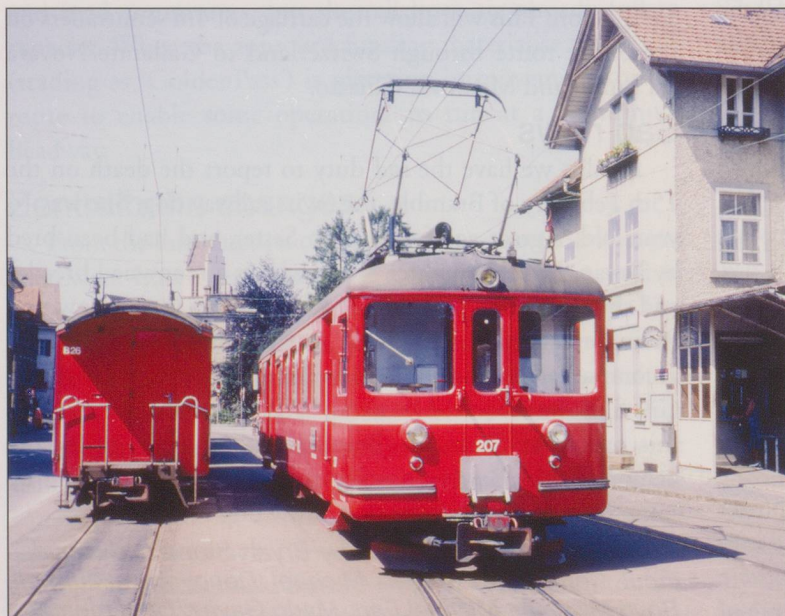
BDe 4/4 207 (ex BTI) on 12th July 1982 at Frauenfeld Stadt (with old station and administration building).

The FW is a local railway that does not serve any tourist destinations, but it has a very interesting story. It is one of the oldest narrow gauge lines in Switzerland, and was not constructed as an electric suburban line (as were the Trogenerbahn or the Forchbahn), but as a roadside steam railway. At the time thousands of kilometres of such lines were being built across Europe to serve rural communities – few now survive. Projects for a standard-gauge line to serve the area failed to become a reality, and the main lines Winterthur – Frauenfeld – Romanshorn (Nordostbahn) and Winterthur – Wil – St. Gallen – Rorschach (Vereinigte Schweizer Bahnen), failed to serve communities in the Murg valley. Needing links into the developing national railway system the region decided to construct the narrow gauge line as a cheap and pragmatic solution, and originally – after the example of Waldenburger Bahn – it was planned to build it at 750mm gauge. It is also interesting that at the inauguration of the line on 1st September 1887 all the stations were only constructed as freight sheds. Only at Frauenfeld Stadt was a little station building and depot provided, at all the other stations on the line the commercial functions (selling tickets, etc.) were done by the owners of nearby Gasthofs. The administration of the little company was in a poor location in a factory near the Frauenfeld Stadt