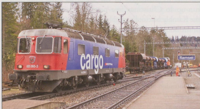
620 065 3 at Ramsei.

platform. There are S-Bahn trains from Bern via Burgdorf every half hour, running alternately to Langnau and Sumiswald-Grünen, with a shuttle connection to Sumiswald-Grünen from the Langnau trains. Fortunately the junction points are at the north end of the station; at the south (Langnau) end, trains are all routed to and from the same platform, so there is normally no need to change the points at that end - otherwise a bike would definitely be necessary! Incidentally SBB don't get rid of their old signalling frames as fast as Network Rail; at both Küssnacht am Rigi and Travers, existing mechanical signalling frames have been left in the station building after replacement by electric points and colour-lights.