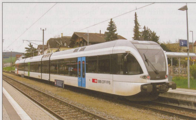
Former Turbo, now SBB, 3-car GTW at Stein am Rhein.

Ex Turbo Stadler GTW 2-car unit No.526 741-4 was working the single-rack Sissach-Olten via the old Hauenstein Tunnel at the end of last year - complete with publicity material about the new St Gallen S-Bahn services on the luggage racks! This 18km line is one of the biggest loss-makers on the SBB system and until recently was the preserve of (for Switzerland), a fairly tatty un-renovated NPZ/Kolibri unit that operated its hourly service. This section was built as part of Switzerland's first main line and was primarily concerned with taking through traffic from Basel to Olten. As it takes a steadily graded climb south from Sissach the line and its stations are often above the villages. Local traffic on the line is sparse, despite it being included in the Basel S-Bahn system as route S9, and the valley is unusual in having a parallel PostAuto service that better serves the communities. It is assumed that as the 10 year old GTW unit is some 20% lighter than a 20 year old two-car NPZ unit, and hence will be more economical to operate, it has been drafted-in to help keep the losses down.