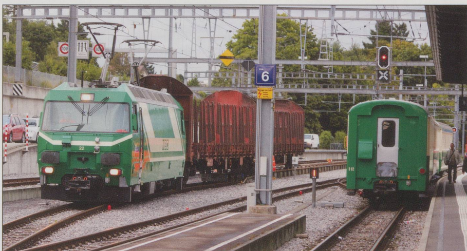
TOP: An SBB shunter manoeuvres standard gauge wagons onto metre gauge transporter wheels at Morges.