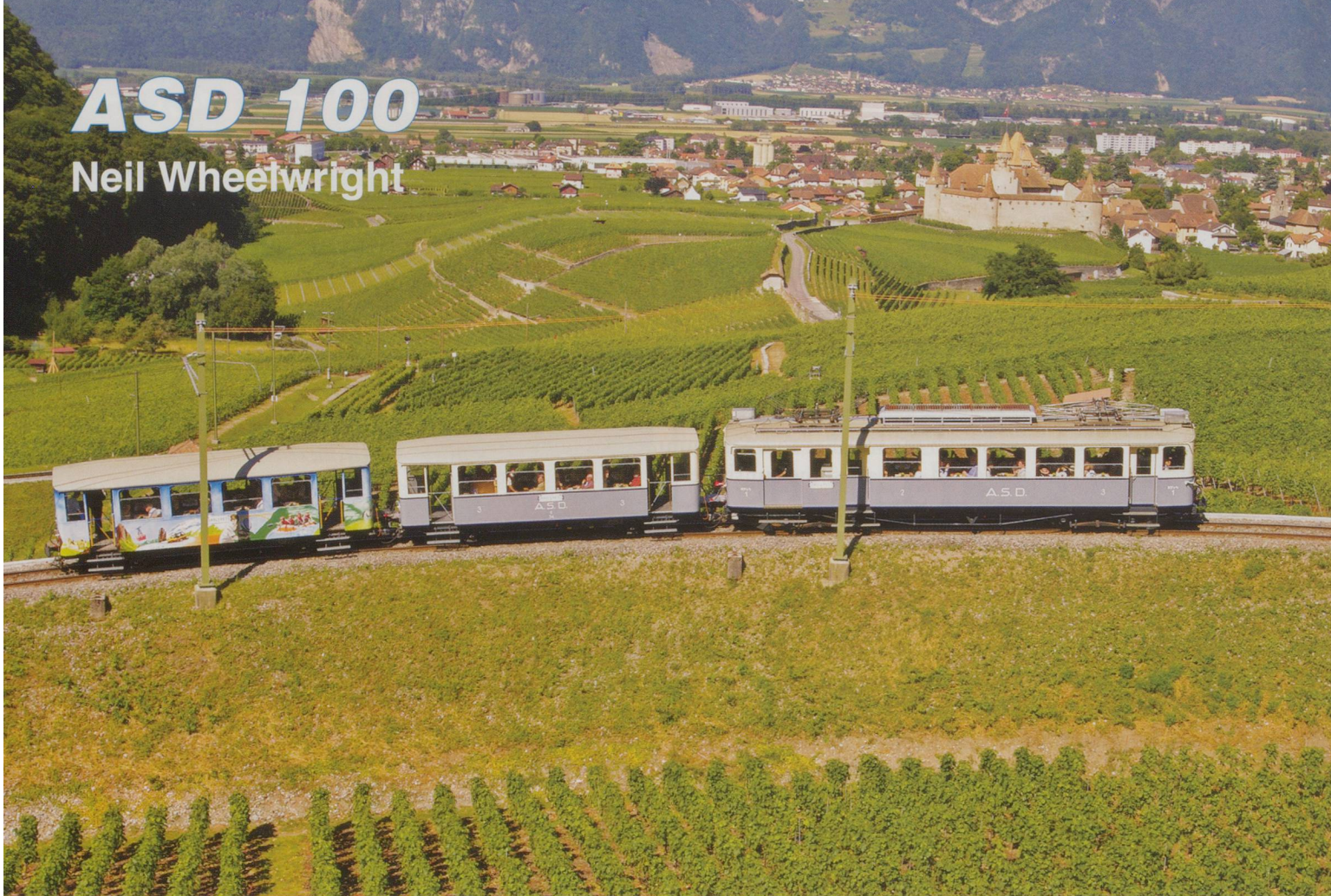
BCFe4/4 No. 1 + B34 + B35 proceeding up the line with views of Aigle Castle in the background.