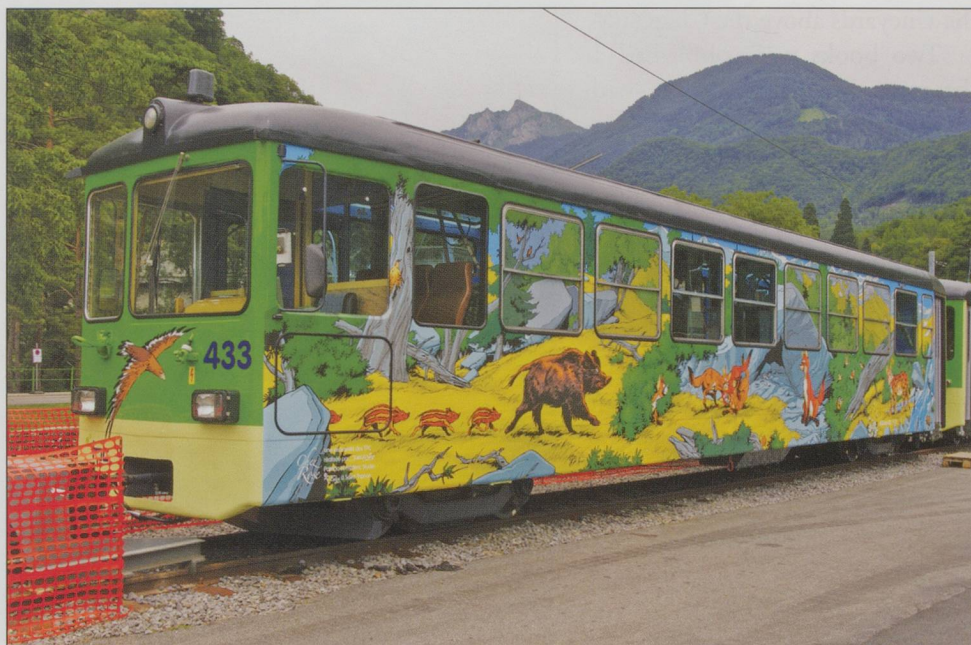
ASD Arst 433 in "Derib" livery at the old dépôt.

ASD restored BCFe4/4 No 1 + B34 + B35 ascending through the vineyards above Aigle.