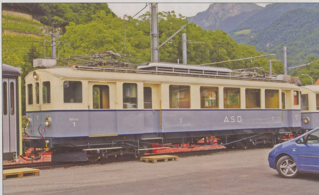
ASD BCFe4/4 No 1 in grey & white 1940s livery at the old depot.

any celebrations and the weekend of 5 & 6th July proved to be host to many events in the town. On the Friday there was a parade of school children with each class dressed to a particular theme. Over the weekend there was a 'Fête de Couleurs', which appeared to be a world music festival, and on the Saturday there was also the 3rd annual 'Mondial du Chasselas' wine festival held in the