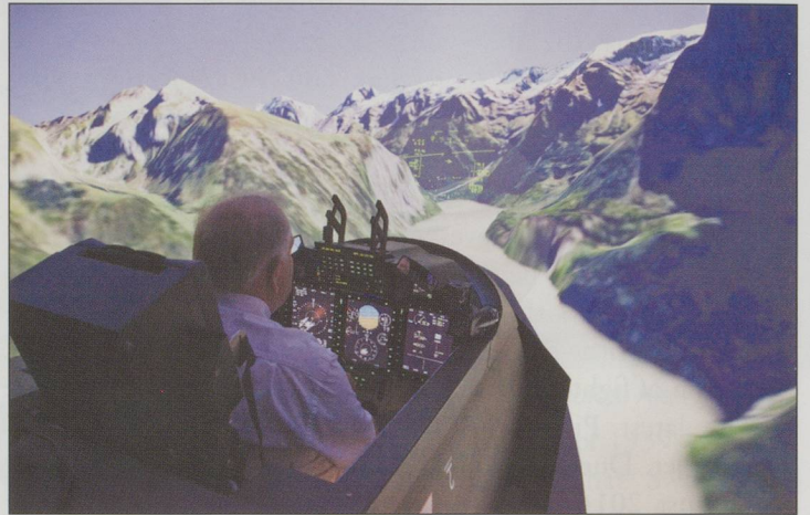
A heavy hint that time's up - all the valleys fog-bound – luckily just in the simulator.

for the simulators; and, despite the session being extended by an hour, the last man out of the PC-21 needed the encouragement of all the airfields below him becoming fog-bound! Thus ended a most interesting and enjoyable tour.