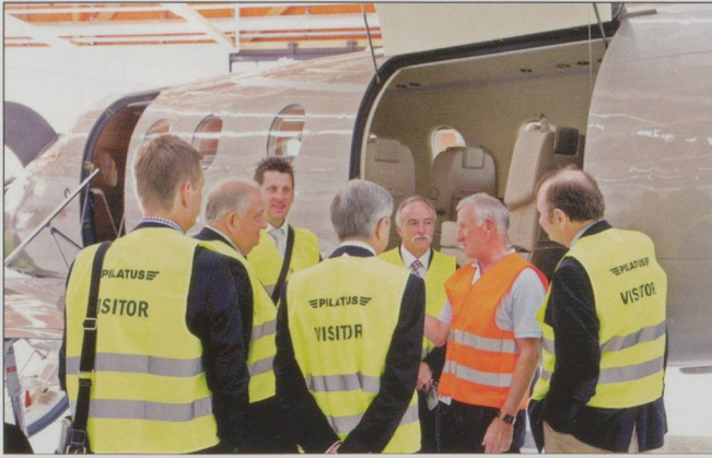
A close look at a new PC-12 and its large cargo door.