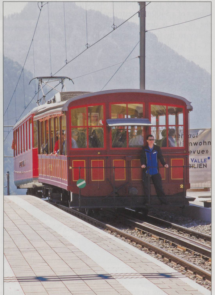
BELOW: A VRB train arriving at Kaltbad station.

It remains true of course that no stay in Switzerland is satisfactorily completed without several railway journeys. Marion and I had arranged to stay on for a few days after the Pilatus visit, this time in Beckenried on the south shore of Vierwaldstättersee. We made extensive use of local transport, with Stans station readily accessible by PTT bus (complete with free Wi-Fi); and with all the usual lake steamer pleasures accessible from the village ship station. We had two fine days on Rigi, with the Vitznau Rigi Bahn fully open; on our last visit, significant track work and the rebuilding of Kaltbad station meant no services from Vitznau to the top of the mountain. Ron Smith's recent report in the magazine provides the latest news on current and planned work on the Rigi Bahnen. One of our walks took us along the route of the Rigi Scheidegg Bahn, at its completion reputedly the highest adhesion railway in Europe. Sadly closed in 1931, the former trackbed provides easy walking and great views. Along the way are a few reminders of the railway's past. Carriage number seven now stands near Unterstetten as a holiday cottage, its axle boxes providing cast-iron evidence of its RSB ownership. Also near Unterstetten is the 50m long viaduct which used to carry the track: although this is in need of some serious repairs the path over it remains open. ☑