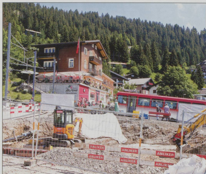
Work still in progress at the new Kaltbad station.