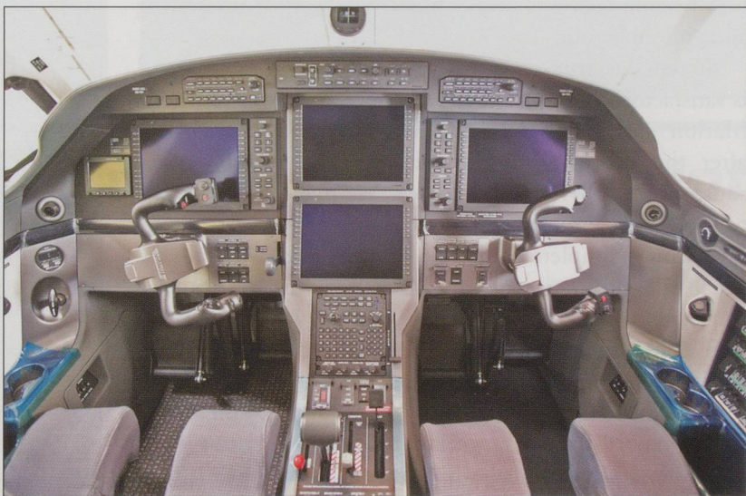
TOP: Fitting out a PC-12 fuselage.