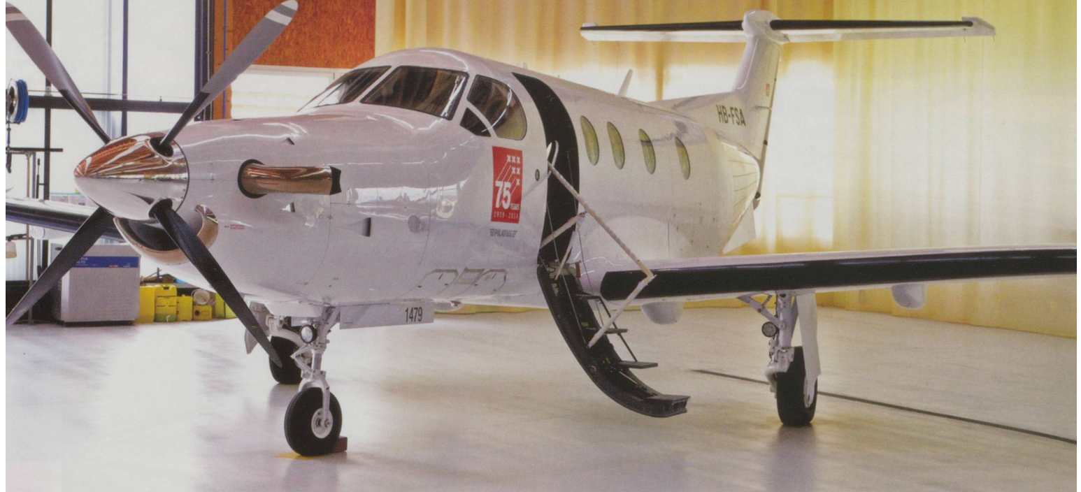
An immaculate new PC-12 awaiting delivery.