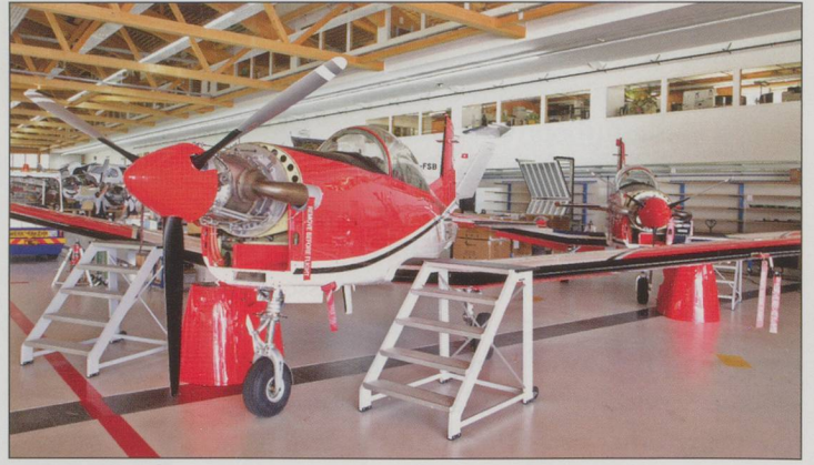
An upgraded PC-7 of the Swiss Airforce.