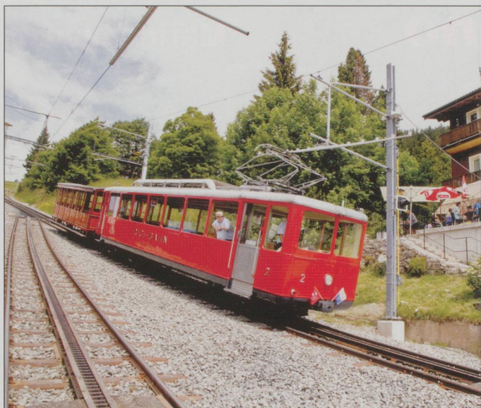
A descending VRB train at Rigi Kaltbad.