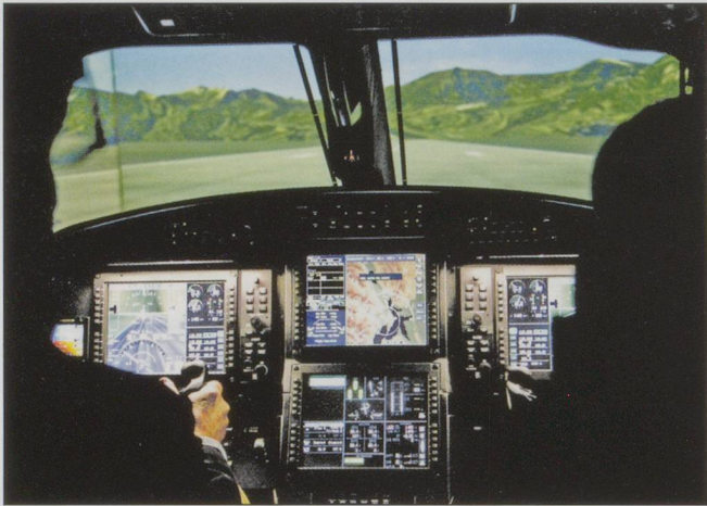
In the PC-12 simulator.