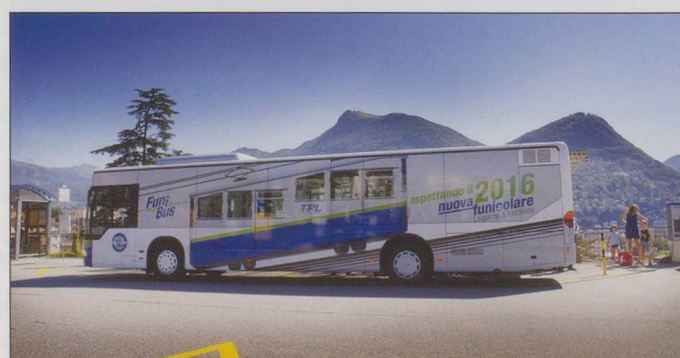
TOP: Car No. 1 is lifted out. MIDDLE: Car No. 1 at the top in the SBB station concourse. BOTTOM: The replacement bus service.