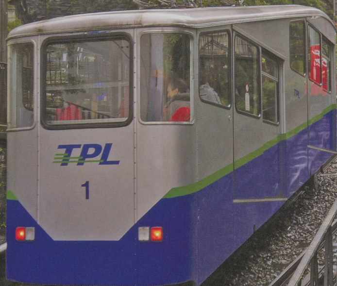
The two cars cross at the intermediate passing loop.