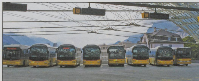
Chur PostAuto station with a selection of vehicles.

A Chur – Zurich InterRegio for the journey to Pfäffikon.