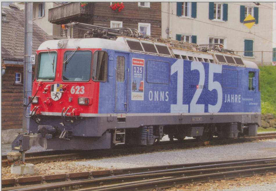
Ge 4/4 II No. 623 in 125 years RhB livery parked at Disentis 3rd September 2014.

The first section of what was to become the RhB, opened in 1889. This was the Lanquart-Davos Railway, although it only reached as far as Klosters in that year. It was another year before it reached Davos. This year has therefore the RhB's 125th anniversary, and they have been celebrating all year. Ge 4/4 II No.623, Bonaduz is the loco painted in 125-year livery.