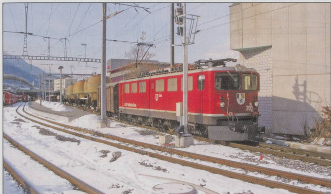
Now withdrawn RhB Ge 6/6 No. 702 at Chur when still in regular service.

finally delivered by July 1964. When still new in December 1963 No.11201 was severely damaged in a fatal accident in Oberwinterthur so did not reappear until October 1964. By this time the series was renumbered as Nos.11101-6 and these became the pre-cursors to the biggest series of locos (built over a 15-year period) that Switzerland has ever seen - the Re4/4 II and Re 4/4 III. Although the ranks are slowly thinning many of these will still run for some years.