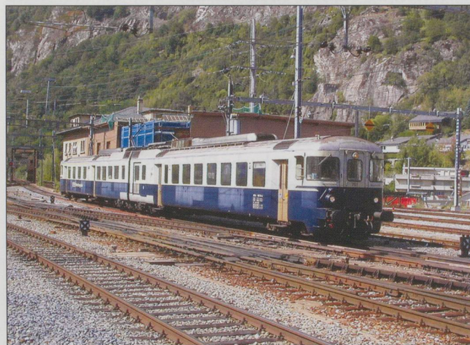
A BLS 'Blue Arrow' at Brig.

In March, the motor coach Bef4/4 No.642 (ex-RhB ABe 4/4 No.488) dating from 1973, that has normally been used to haul the heavy trains of domestic garbage containers, suffered a serious short-circuit defect. Damage to two traction motors was severe, and re-profiling of all wheels was due, so it was decided not to effect repairs to this 40 year-old veteran. Earlier this year the CJ acquired four Ex-FW units (see June's SE) with the intention of using one or more of these on the freight duties No.642, and its ex-RhB sister No.641, were operating. This move apparently came none too soon.