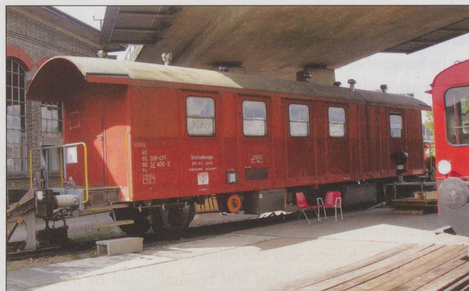
Support wagon at the Bahnpark roundhouse in Brugg.

It has been announced that following establishment of a finance plan, all three locomotives, G3/4 No.208, HG 3/3 No.1067 and No.1068, will be restored after the depot fire in November 2013. No.208 is expected to be serviceable in 2015, while No.1067 will be ready in 2016 and No.1068 will follow. The last loco had not run for 40-years having been on a plinth in Meiringen.