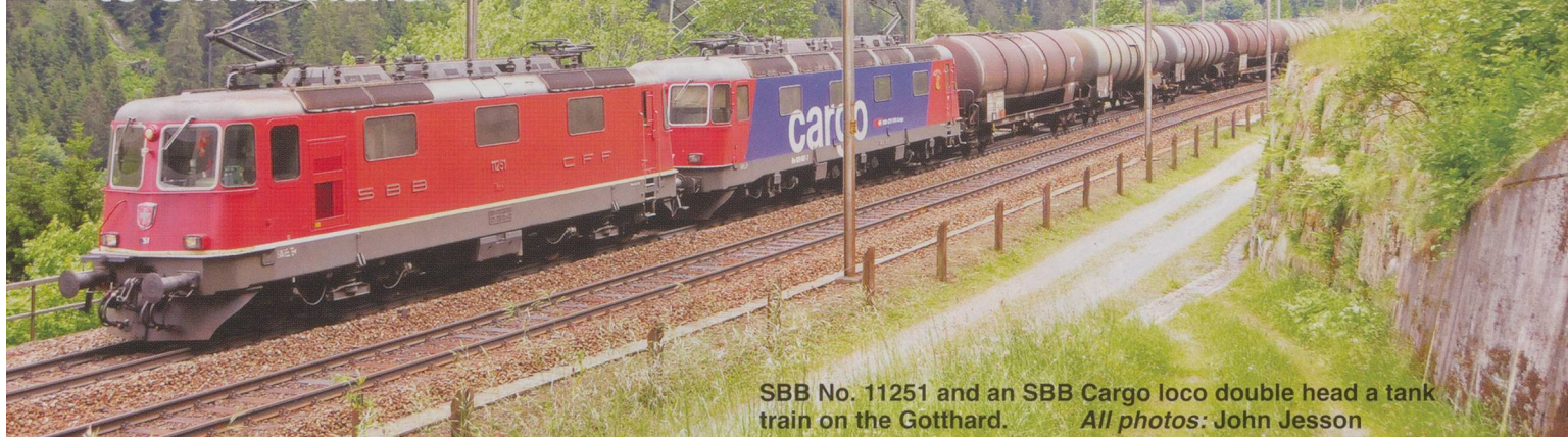
SBB No. 11251 and an SBB Cargo loco double head a tank train on the Gotthard.