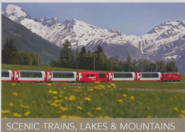
SCENIC TRAINS, LAKES & MOUNTAINS

Order your copy of STC brochure for Inspirational ideas for your next Swiss holiday