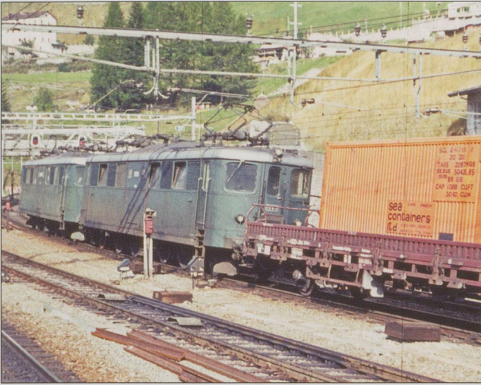
ABOVE: After detaching the assisting loco, the freight goes forward with its pair of Ae 4/6 locos, Nos.10808 + 10811, according to my notes of the time.