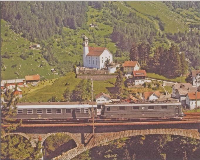
BELOW: No.11410 'Basel Stadt' on a northbound International express on the Middle Meienreuss bridge, with Wassen church behind.