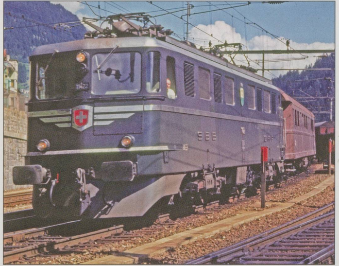
ABOVE: No.11422 'Vaud', at the head of an express from Italy, curves into the Gotthard tunnel at Airolo in the summer of 1967.