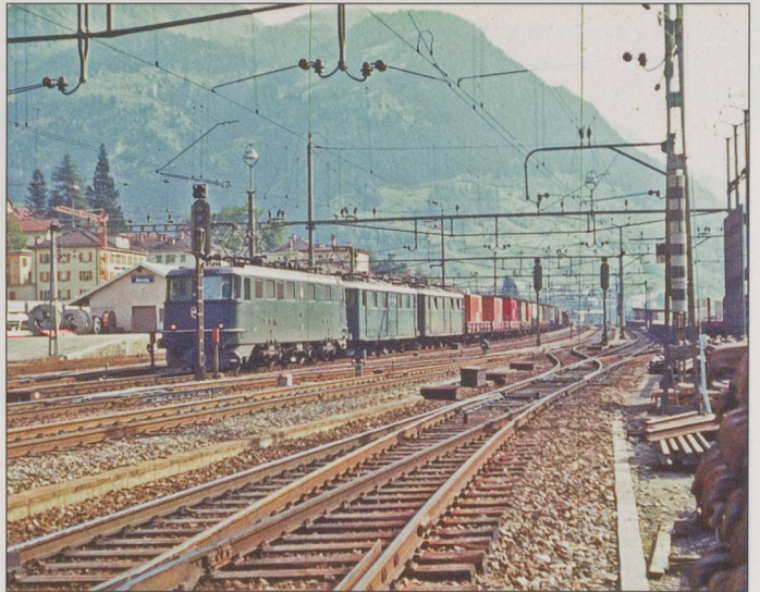
BELOW: A northbound freight has arrived at Airolo and is about to detach the Ae 6/6 which has been the assisting loco on the climb from Bellinzona.