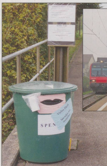
The local appeal bin, notice and out of service clock..

During last summer the SBB platform clock ceased to function. After a few days, a member of SBB Infrastructure came along, climbed up his ladder, and covered the clock with a plastic bin bag. Expectations were high that with usual Swiss efficiency, a replacement clock would soon be provided. Weeks went past and nothing happened. Several passengers enquired of the SBB as to what was happening. No one at SBB seemed to know exactly why the clock was not being repaired or replaced. It was claimed that it was not a financial