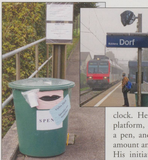
The local appeal bin, notice and out of service clock..

During last summer the SBB platform clock ceased to function. After a few days, a member of SBB Infrastructure came along, climbed up his ladder, and covered the clock with a plastic bin bag. Expectations were high that with usual Swiss efficiency, a replacement clock would soon be provided. Weeks went past and nothing happened. Several passengers enquired of the SBB as to what was happening. No one at SBB seemed to know exactly why the clock was not being repaired or replaced. It was claimed that it was not a financial