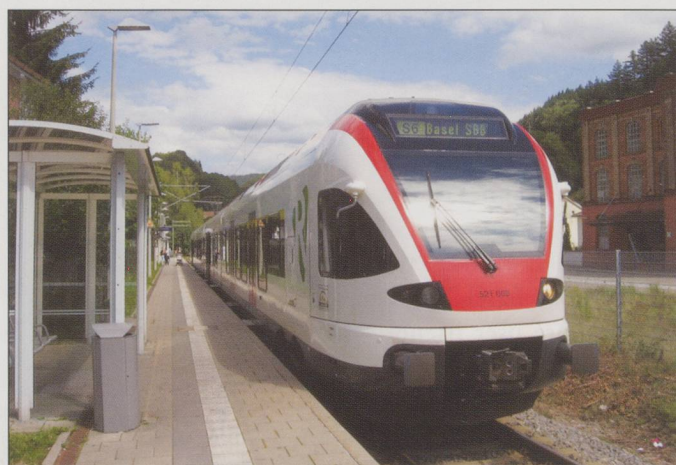
TOP: Crowds in Basel's Rumelinsplatz.