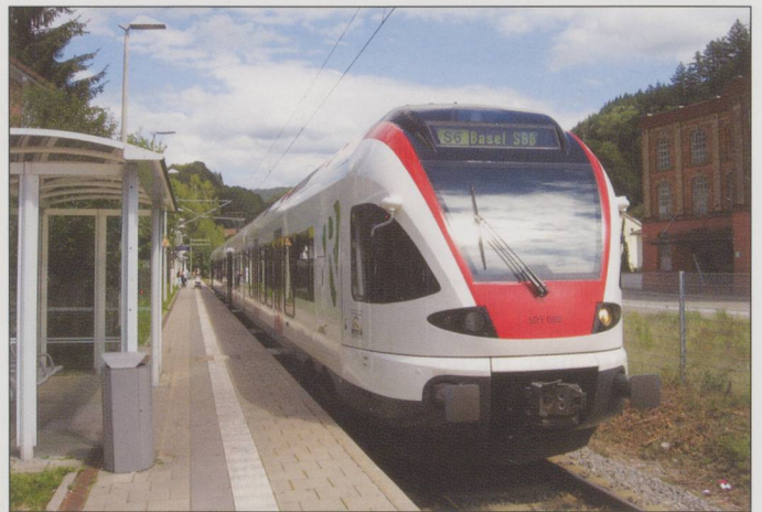
TOP: Crowds in Basel's Rumelinplatz. ABOVE: SBB RABe 521 008 waits at Zell to return to Basel. LEFT: Crowds enjoying Jazz in the Schnabelgasse.