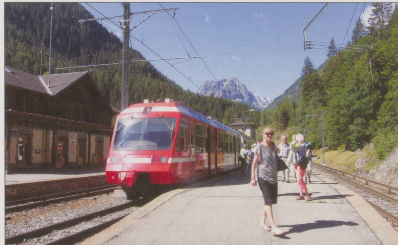
On 6th July 2014, a BDeh 4/8 is at Le Chatelard Frontiere with the Aiguille de Mesure in the background.

Unusually for a Swiss railway, on some sections of the route the 800V dc power supply came from a third-rail, but the length between Finhaut and Le Châtelard-Frontière has now been replaced with overhead catenary. Over the border in France, the track has been improved with heavy-duty rail, ensuring quieter running. The 1882m Tunnel des Montets, that links Le Buet with Montroc-Le Planet, has been modernised, with drainage improvements. This tunnel is used in emergencies, and in the winter, by road traffic, so safety standards have also been uprated. New rolling stock has been purchased for through running, with two new Stadler Beh 4/8 three-car units available since 2013. However, although these were running in 2013, I didn't see them in 2014. Unfortunately the Swiss and French authorities have not reached agreement on their use in France, although they are identical