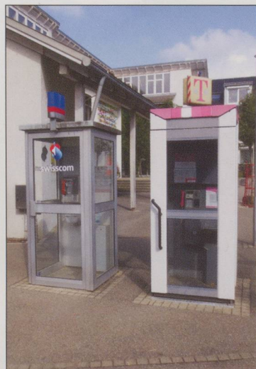
FAR LEFT: Divided Loyalties.