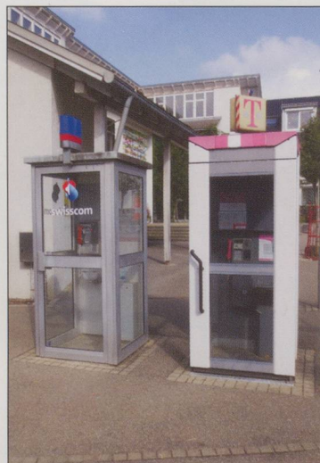
FAR LEFT: Divided Loyalties.