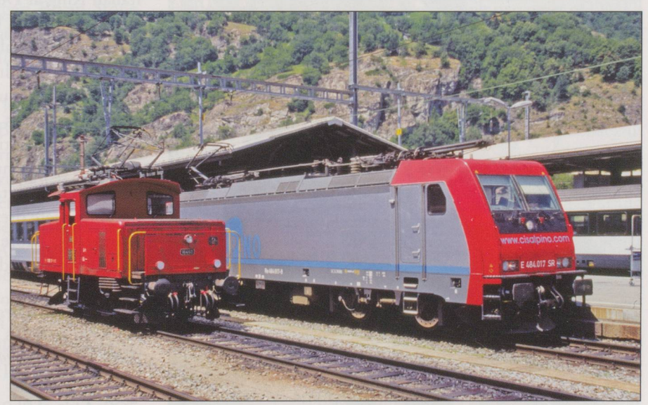
TOP: During the 70s, the TEE 'Lemano' was formed of Italian stock, shown here about to leave Brig for Genève behind Re 4/4II No. 11184. MIDDLE: SBB Re 4/4IV No. 10101 'Vallée de Joux' awaits its next duty at Brig. BOTTOM: The unreliability of the Class 470 units led to the use of multi-voltage Re 484 locos and hauled stock on some Cisalpino workings. 484.017, heading for Milano, with Ee 3/3 No. 16460 alongside, during the station stop at Brig.