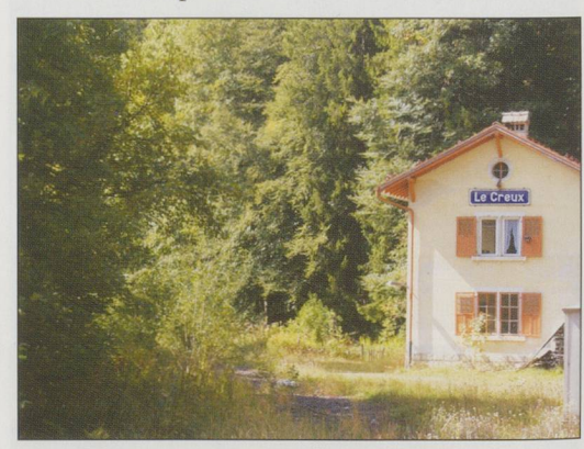
Le Creux. The station closed in 1888 but still maintained near La Chaux de Fonds.

Bern, ran into Bern Wylerfeld, on the east bank of the Aare gorge, as there was no bridge and in 1859 the SCB's line to Thun was built from a junction at Wylerfeld. In the meantime, the first bridge at Bern allowed the line to be