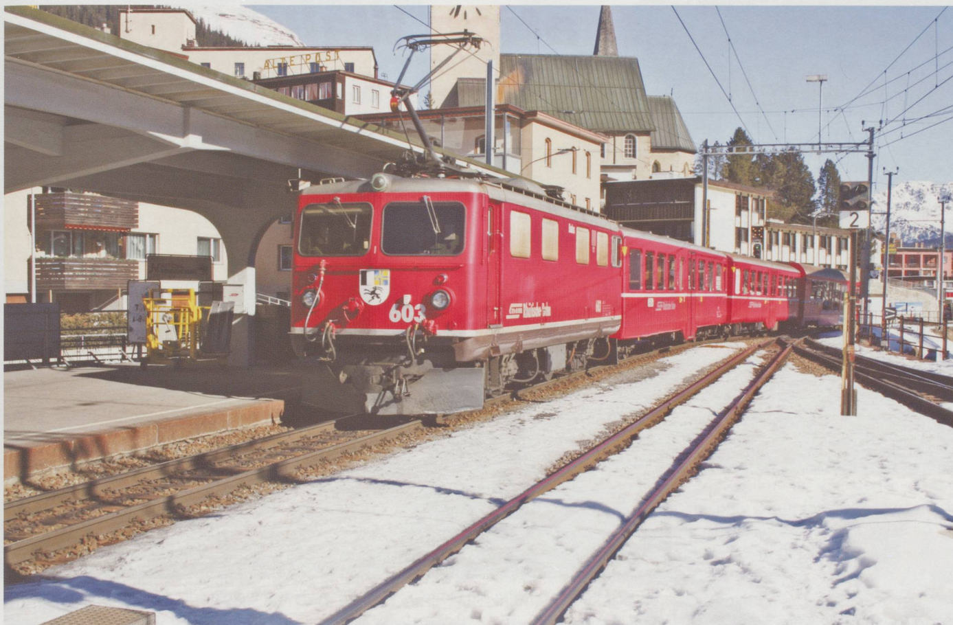
RhB Ge4 4 I 603 arrives at a snowy Davos.