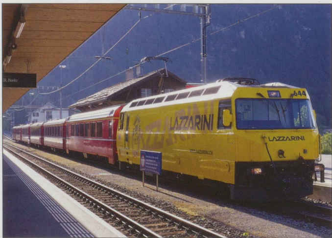
The only sunny morning at Filisur – our hotel in the background.

Day 8 was hotel change-over day and that entailed a full ride on the MGB and RhB from Brig to Filisur. Luckily Friday's snow was still around from Realp to the far side of Oberalp and the scenery looked at its best. Sadly the heavy case changeover at Reichenau resulted in me getting a very painful back that was eventually sorted by a very helpful pharmacist in Chur two days later. The forecast for Graubünden was not great for the coming week so as Day 9 looked the best, it was up the Albula Valley and then over the Bernina line to Tirano. There was sun until we dropped down to Alp Grüm, but no rain. On the return the sun reappeared at Ospizio Bernina and a stop was made at St Moritz.