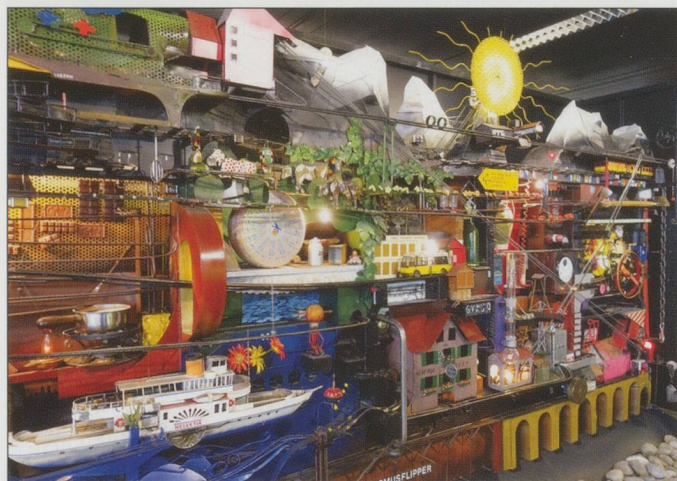
ABOVE: The wonderful mechanical "toy" at the Verkehrshaus – not to be missed.

Day 11 was forecast as rain all day so a check on "tinterweb" showed we could get to the Verkehrshaus Museum in Luzern (half price with a Pass), via Chur and Thalwil and get a train back 2 hours later. The return was via the SOB to Pfaffikon and we were amazed at the number of passenger trains in and out in the 50 minutes we had to wait for our connection back to Chur.