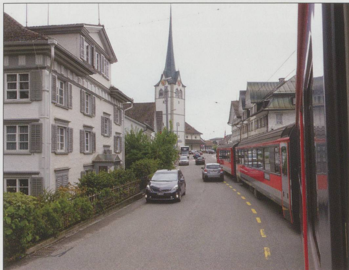
Part of the spectacular road-side ride from St Gallen to Appenzell.

Day 12 was dull so off via Davos to Klosters – but it was “shut”. After the skiing season and before the summer peak, some places seem to go into hibernation, so a quick coffee and on to Scuol Tarasp. The pass to Klosters had had snow but the Engadine Valley was also slightly white. As we retraced the valley back towards St Moritz the snow got more prominent, such that the lake-side resort had about 8”, but as usual all the roads and paths were cleared. As at Klosters, St Moritz was “shut” and on a personal note, I think both are very overrated. So back on the train, down the frozen Albula valley to the new railway museum at Bergün (free on a Pass). The superb model railway was being run and the upstairs displays were typically “Swiss”.