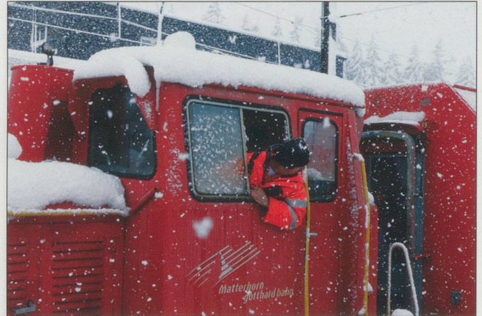
Who'd be a shunter driver at Andermatt in May?

Day 6 was forecast to be wet and it was. So a day riding trains was in order. Through the Simplon to Domodossola, Centovalli to Locarno and then over the Gotthard to Erstfeld. What a surprise though at Göschenen to find everything white – snow in May! Back up from Erstfeld, up the Schölenen gorge to a very snowy Andermatt, with snow all the way back to Brig on the MGB.