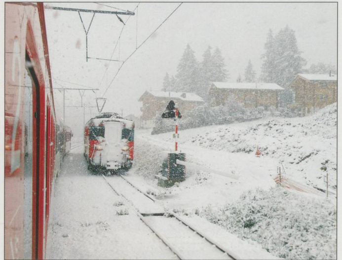
Snow on the Matterhorn-Gotthard-Bahn.