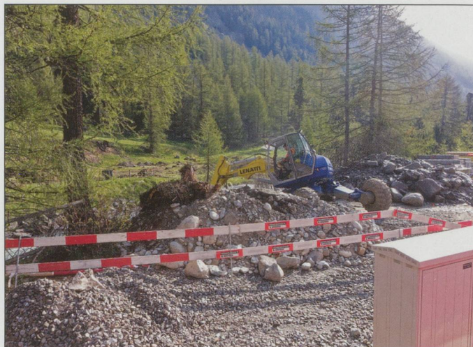
Preparation work for the new Albula tunnel at Spinas.

Arosa and back before completing the loop via Landquart, Klosters and Davos.