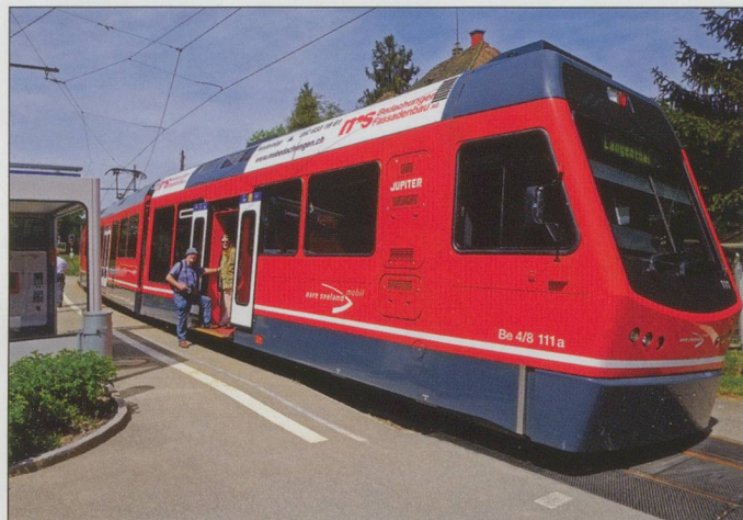
Bryan and Johanna Stone make sure the photographer doesn't get left at the very end of the St Urban line.

seemed good value for 98 train rides, 3 boat trips, 4 cable cars, 6 buses, 2 trams and discount on 2 mountain rides (including one steam) and several museums most free. At a rough estimate we’d travelled over 3,000 km in 15 days. The trains were mostly on time, but quite a few were 2, 3 and up to 5 minutes late, many for no apparent reason. And two train failures – the Swiss must try harder - but are still far superior to those in the UK. 🇨🇭