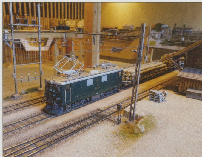
BELOW: The model railway layout at the Bergun museum.