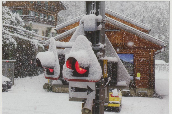
ABOVE: Is the train on-time? Who knows?