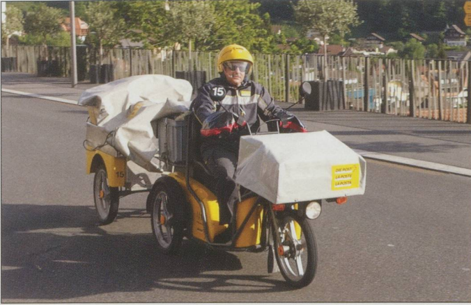
Delivering the post at Spiez.

Day 4 saw us on the Rigi via Spiez, Interlaken, the Zentralbahn, ship from Luzern to Vitznau and the Rigibahnen. Back down via the Weggis cablecar (both train up and cable car free on a Pass) to a crowded Luzern and then train to Bern, 5 minutes late in and 10 minutes late out. At Spiez the second Re460 in two days failed so all out and into the next service to Brig.