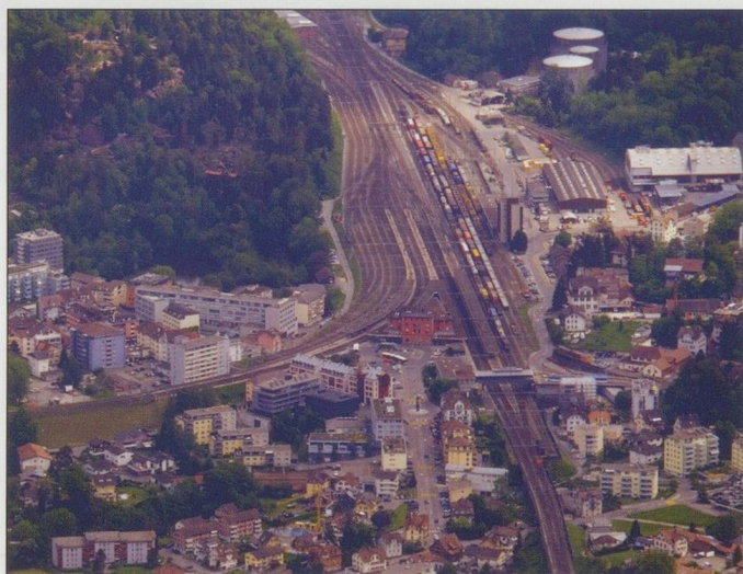
Train spotting from the Rigi – looking down on Arth Goldau.

An airship over Zurich – is this a first for this form of travel in Swiss Express ?