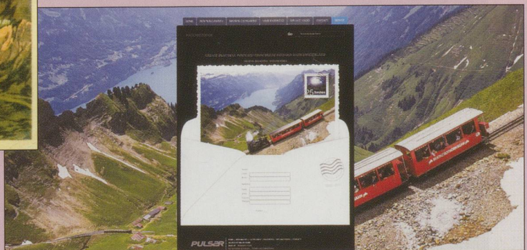
RIGHT: Modern e-card - courtesy www.ecardmedia.eu.