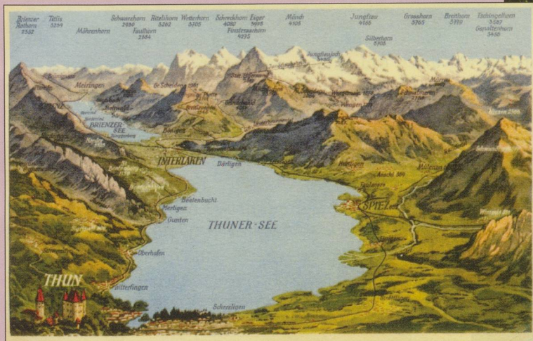
ABOVE: An aerial depiction of Lake Thun that also shows the old tramway route on the northern (LH in this view) side of the lake.