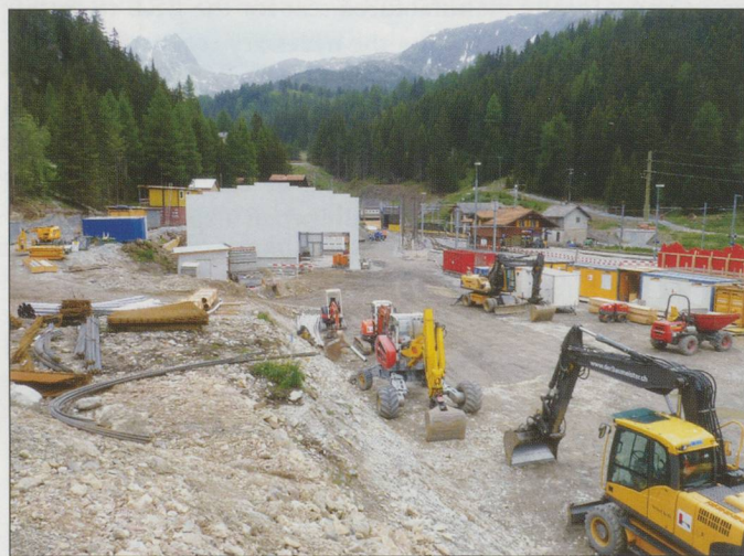
Albula Tunnel Works.