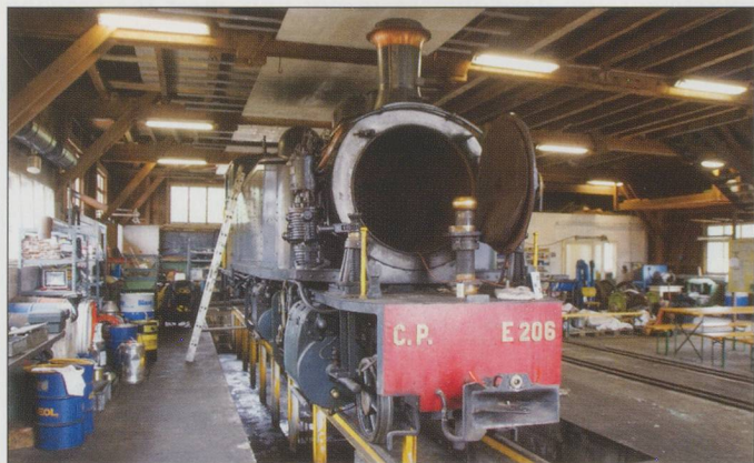
Portuguese Mallet locomotive No 206 on CJ.

The former Portuguese Mallet locomotive No. 206, a 2-4-6-0T compound engine, has spent some time in the back of the shed in Pré-Petitjean. The loco needs re-tubing to run again and work on this big job is now starting. In the meantime the 0-4-4-0T compound Mallet No.164 must handle the 2015 steam programme. Fortunately she is in good condition, as La Traction operations are very much in demand again this year, both their public and charter trains.