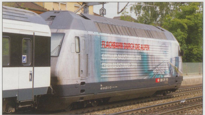
Gotthard Base Tunnel liveried loco .