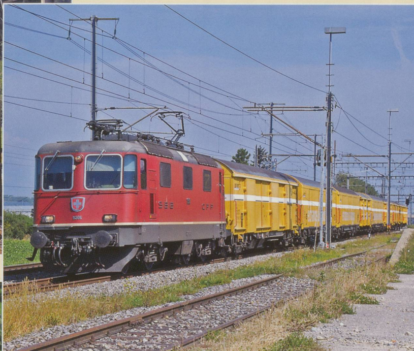
BELOW: No.11306 at Ependes with the Zurich Mülligen Geneva via Eclépens Postal, 50912.