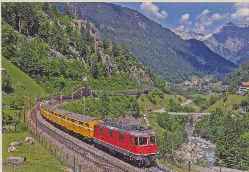
No.11349 at Dangel with the 50921 Postal from Härkingen to Cadenazzo.

As part of the overall strategy to improve the efficiency of the rail logistics associated with the letters and parcels business needs, SwissPost sourced complete 'mail trains' from Swiss Federal Railways. This effectively eliminated the buying of individual 'train kilometres' travelled when many passenger trains were used to carry the mail. SwissPost is now one of SBB Cargo's largest clients in