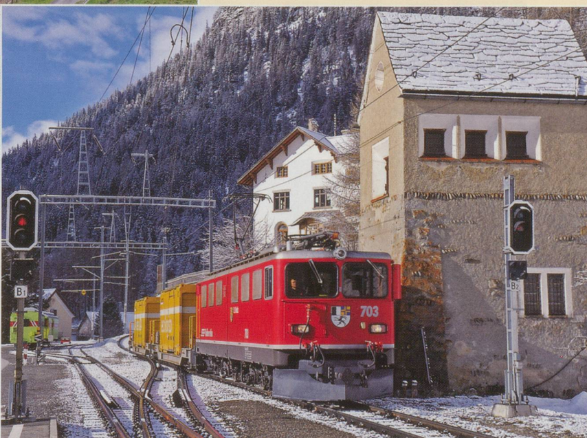
BELOW: RhB No.703 passes Susch with Postal containers for Scuol Tarasp.