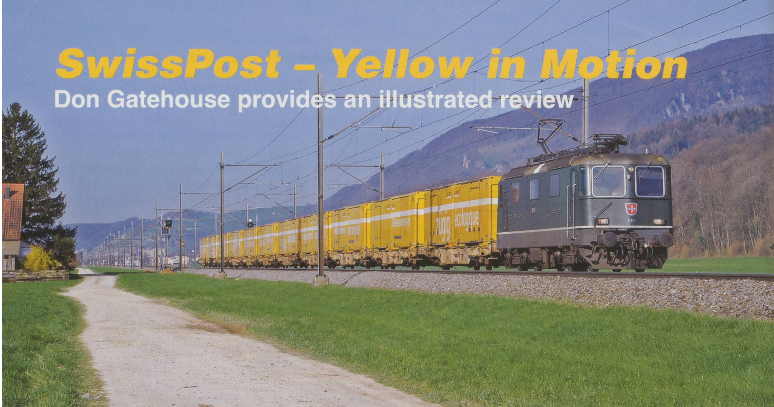
No.11309 working the 50816 Ostermundigen to Härkingen containers.

Don Gatehouse provides an illustrated review