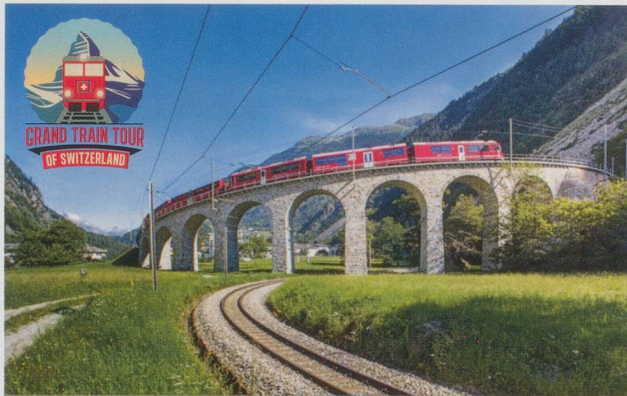
GRAND TRAIN TOUR OF SWITZERLAND

NEW Grand Train Tour Discover the exhilarating 7 night rail holiday taking in the best rail journeys in Switzerland