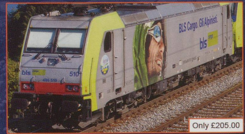
RC73651 BLS Cargo Re486 Electric Locomotive VI Only £205.00