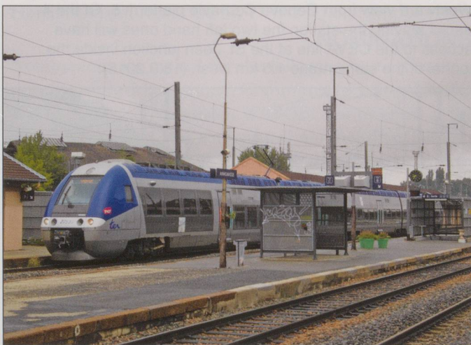
SNCF TER unit at Annemasse Station. This will be much busier once the line is opened in 2019. A new island platform will be built to the left of the picture with switchable overhead power (15/25 kV). (19.9.2015)