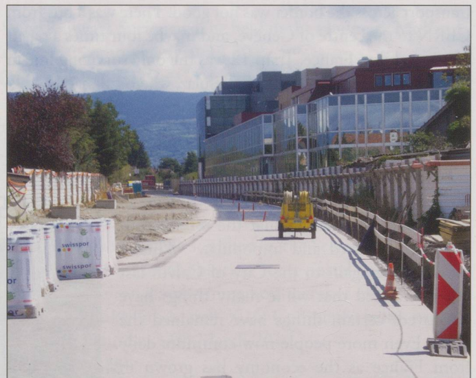
Future 'Voie Vert' near Chêne-Bourg. The old line used to run above ground through the suburbs of Geneva, but the new one is being dug underground and pedestrians and cyclists will roam above on the 'greenway'.

The budget for the 14km Swiss section is CHF 1.6 billion, 56 % from the Confederation and the rest from Canton Genève. The 2km French section of new construction, the improvements at Annemasse station, and those needed on the line to Évian-les-Bains, have a budget of €230m. To aid funding of the project former railway land is being redeveloped for new offices and apartments. Also, because in Switzerland, apart from at stations and airports, shop opening times are still highly regulated, retail outlets at railway stations are highly lucrative and rental income from these is used to partly finance projects like this.