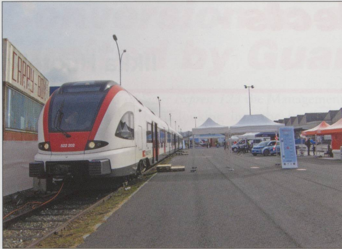
'FLIRT France unit open for the public view at Genève La Praille during a CEVA open day 26.9.2015. It has in addition to the standard 'Swiss FLIRT', support for the French 25 kV power and security systems: platform cameras, : French standard longer nose to absorb impact in case of a crash, and three types of power sockets for the passengers.