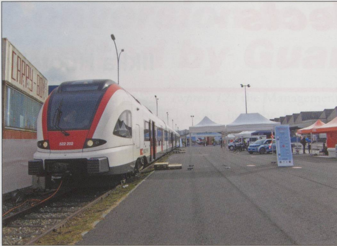
'FLIRT France unit open for the public view at Genève La Praille during a CEVA open day 26.9.2015. It has in addition to the standard 'Swiss FLIRT', support for the French 25 kV power and security systems: platform cameras, : French standard longer nose to absorb impact in case of a crash, and three types of power sockets for the passengers.