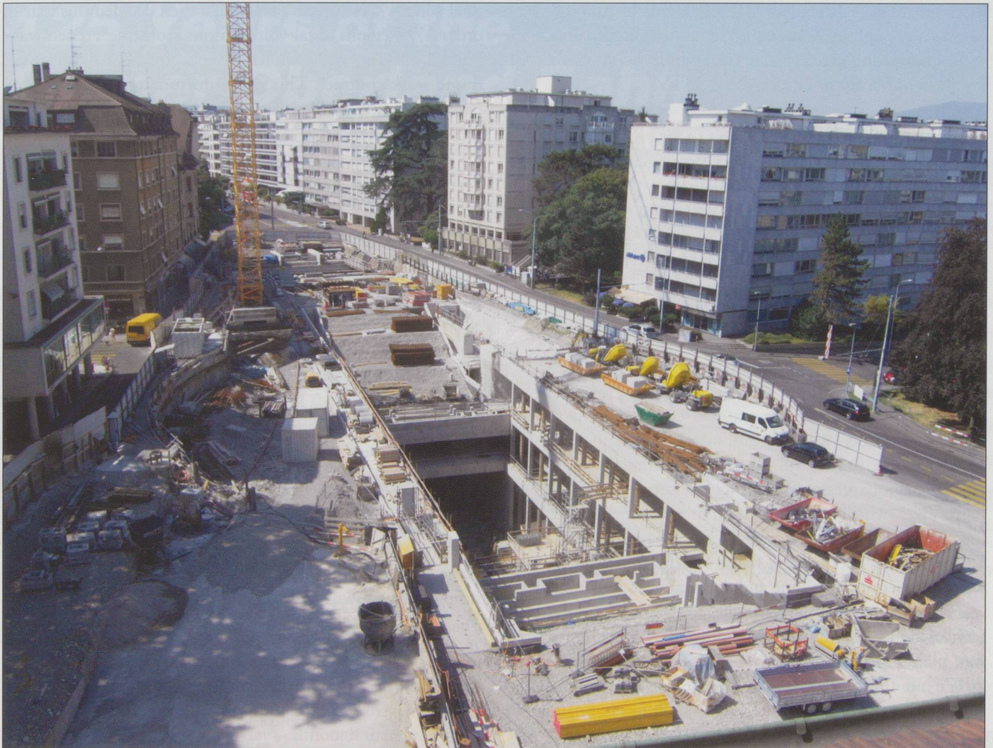
Construction of the future Champel-Hôpital stop. The opposition to the CEVA project was the fiercest here as the station is being built on the site of a neighbourhood park. (19.9.2015)