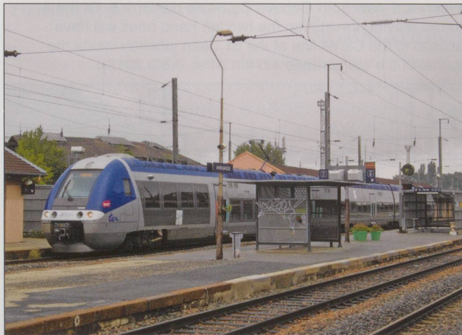
SNCF TER unit at Annemasse Station. This will be much busier once the line is opened in 2019. A new island platform will be built to the left of the picture with switchable overhead power (15/25 kV). (19.9.2015)