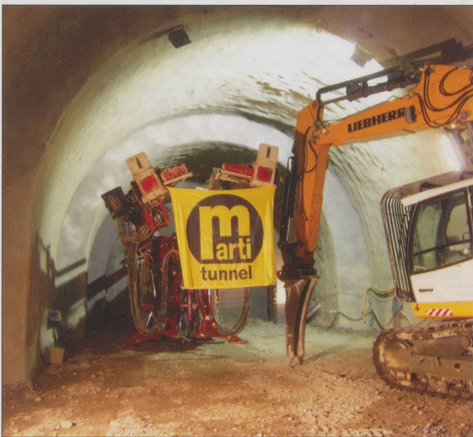
Digging the Champel tunnel. (26.9.2015)