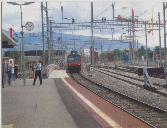
A 'Domino' unit to Coppet approaching Lancy-Pont-Rouge's single platform from the rail yard, where it is moved between services to allow freight trains to pass through. The new station is being built 200 m south where the right hand tracks now terminate. (10.9.2015)