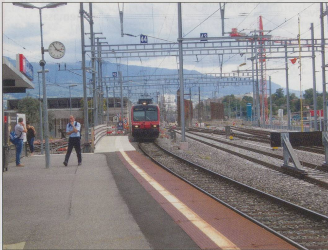
A 'Domino' unit to Coppet approaching Lancy-Pont-Rouge's single platform from the rail yard, where it is moved between services to allow freight trains to pass through. The new station is being built 200 m south where the right hand tracks now terminate. (10.9.2015)