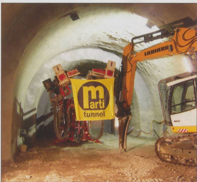
Digging the Champel tunnel. (26.9.2015)