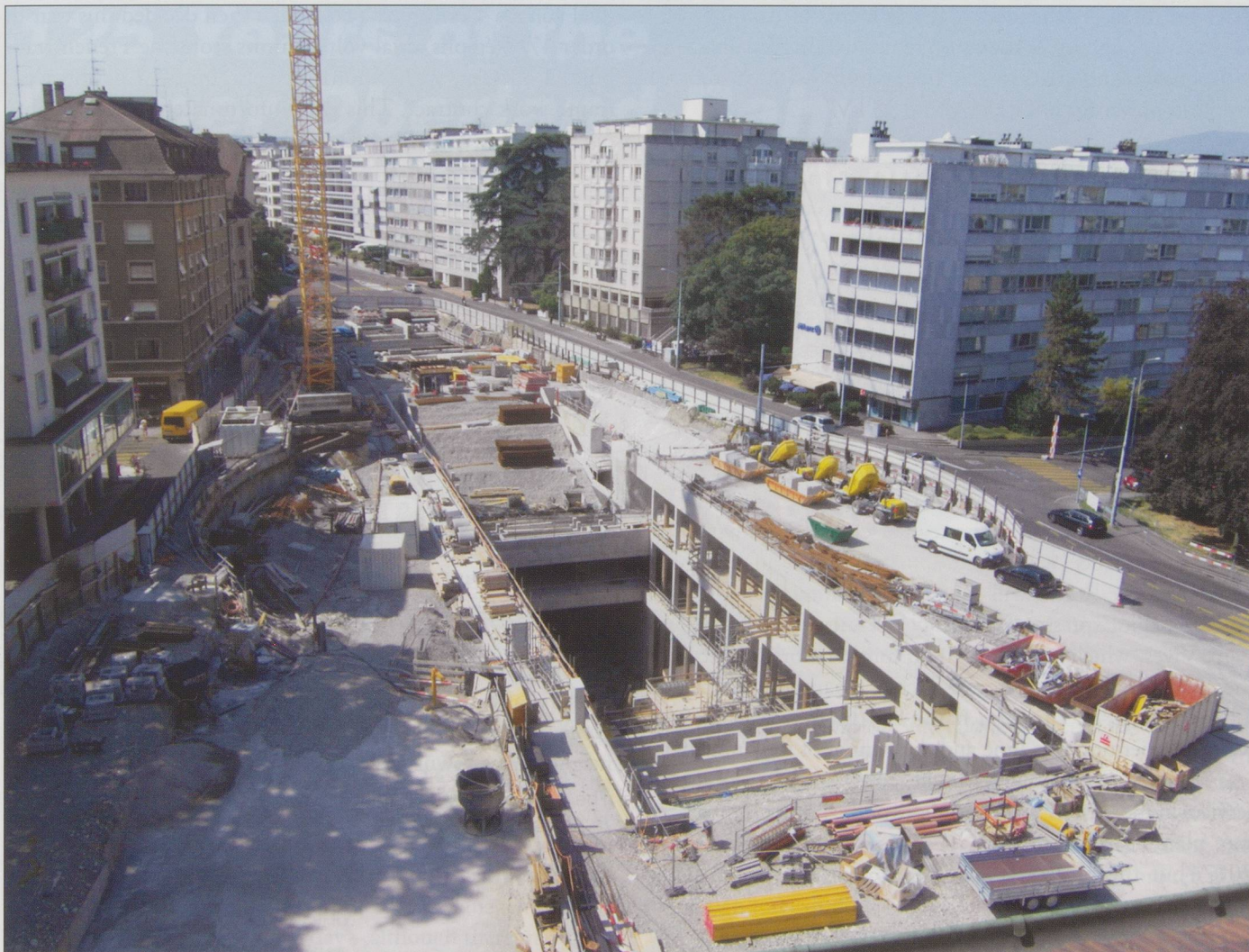
Construction of the future Champel-Hôpital stop. The opposition to the CEVA project was the fiercest here as the station is being built on the site of a neighbourhood park. (19.9.2015)