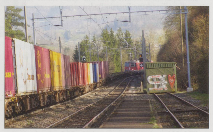
ABOVE: Container train passing Hornussen station. The Land Rover shunter for the scrap merchant is housed in the shed to the right.

The Bözberg line today has two InterRegio passenger trains each way per hour as well as a host of freight trains. Since it is one of the routes from Basel to the Gotthard, numerous companies operate over this route so a variety of motive power can be seen. One can view the operations in comfort from the eclectic 'Rösti Farm' restaurant that is adjacent to Schinznach Dorf station.