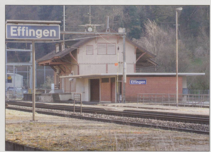
Effingen station. The name board still serves as a time keeping marker for train crews.