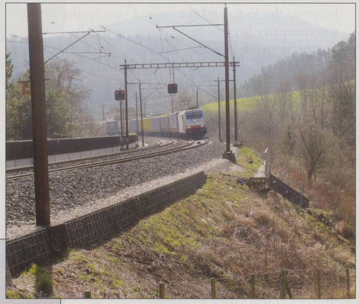
ABOVE: Crossrail container train is seen approaching the site of Villnachern station.

The SBB ripped up the platforms and removed the waiting room. The pedestrian subway exists and public toilets are still available in the wooden house north of the tracks.