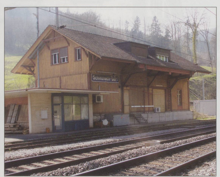
Schinznach Dorf station.

today a private dwelling. A small office with signalling equipment still exists to control the currently mothballed clay loading siding. The modern toilet block exists but is closed. As in Villnachern, the platforms have been ripped up. The pedestrian subway is still open and is used by occasional hikers.