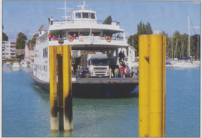
International ferry at Romanshorn.

The railway he travelled on also has its own unique history. Back in the middle of the 19thC the good citizens of Bischofszell were concerned that their small town would miss out on the railway revolution, as main lines were opened through Weinfelden to Romanshorn to the north, and Wil to St Gallen to the south, both in the 1850s. As the major companies would not connect them to the growing network they formed the Bischofszellbahn to build the 23km line connecting Sulgen on the northern line to Gossau on the southern, and mortgaged one-third of the community's assets to fund the scheme. The line was opened in two stages in