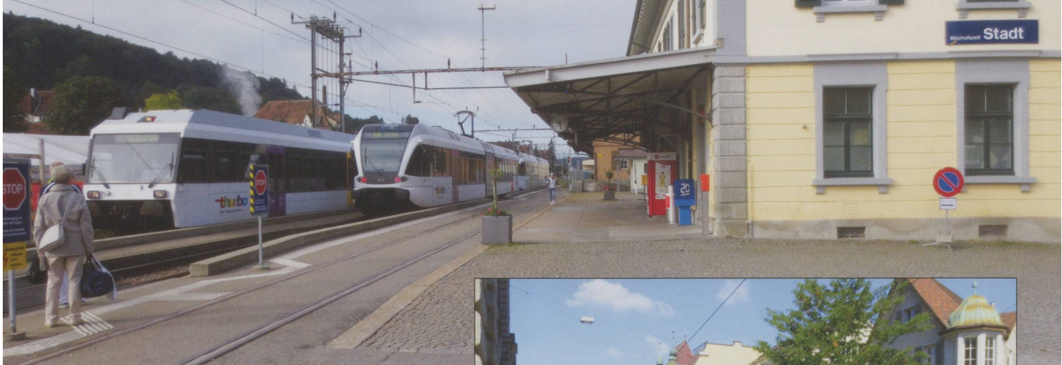
ABOVE: Trains crossing at Bischofszell Stadt.