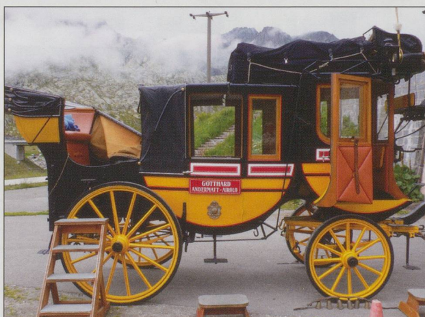
RIGHT: The carriage used now for tourists. LEFT: A depiction of the dangers faced by travellers back in the day.