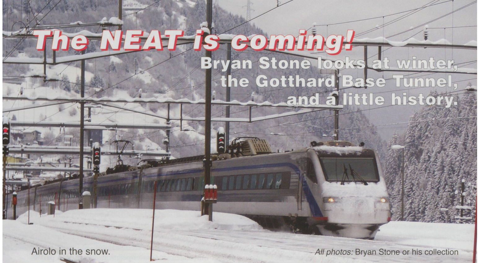
Airolo in the snow.