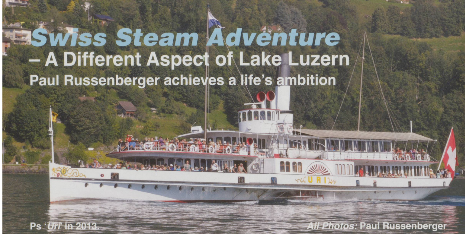
Ps 'Uri' in 2013.