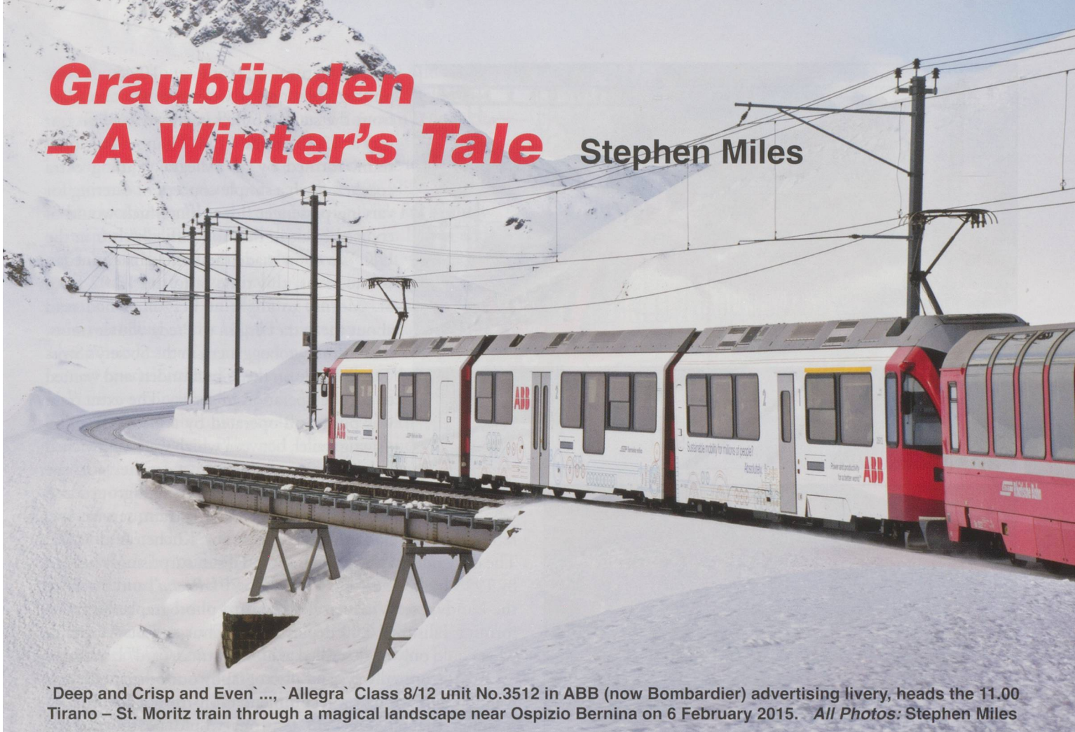
'Deep and Crisp and Even'..., 'Allegra' Class 8/12 unit No.3512 in ABB (now Bombardier) advertising livery, heads the 11.00 Tirano – St. Moritz train through a magical landscape near Ospizio Bernina on 6 February 2015.

Like many railway enthusiasts of a 'certain age' my introduction to Swiss Railways was via the late George Behrend's classic book 'Railway Holiday in Switzerland' first published in 1965. Many years later I finally travelled to Switzerland on an organised package tour, then once it was apparent how easy it was to travel in a country that loved its railways - and where everything connected to provide a fully integrated public transport network - I have travelled independently on many occasions. However, there was still one period of the year that I had dreamed of visiting Switzerland - in winter! When staying at the Grishuna Hotel in Filisur in summer 2014 the owner, Anna, advised that the best time to see snow in that area would be February. The Rhätische Bahn (RhB) is without doubt my favourite railway, so I was overjoyed to find my Christmas present from my wife was a four-night stay in the Grishuna in early February 2015. The hotel was well