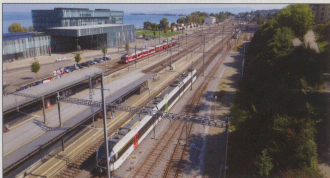
A view across Rorschach Bahnhof. See 'Swiss Tip' on page 46.