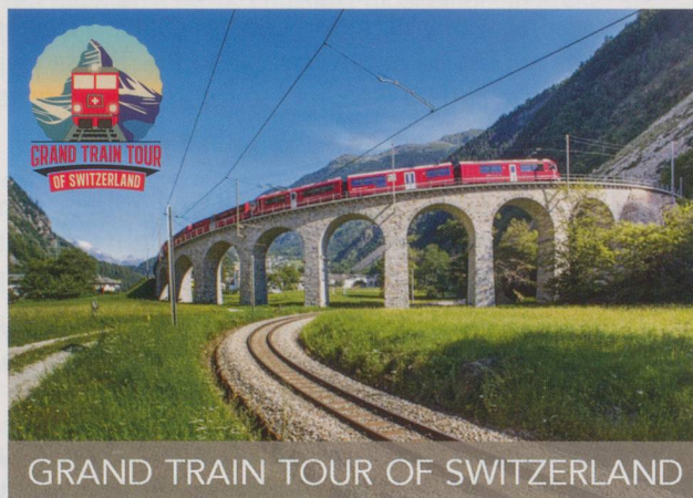
GRAND TRAIN TOUR OF SWITZERLAND

NEW Grand Train Tour Discover the exhilarating 7 night rail holiday taking in the best rail journeys in Switzerland