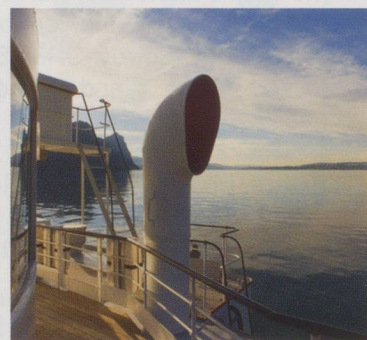
Glacier Express Packages - Tickets/Reservations Scenic Rail Journeys - Switzerland Tailor made Lakes & Mountains Experience Packages Ask for one of our brochures.