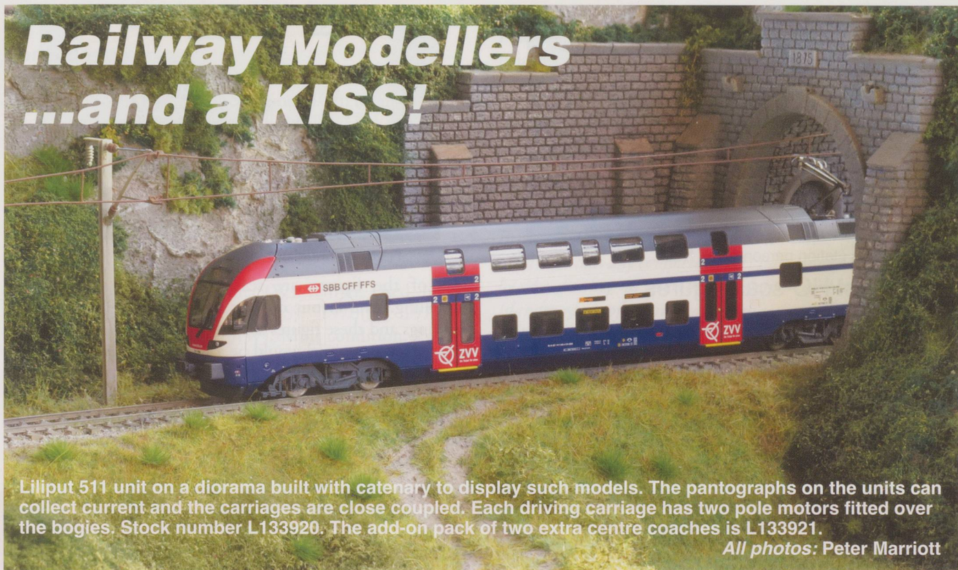
Liliput 511 unit on a diorama built with catenary to display such models. The pantographs on the units can collect current and the carriages are close coupled. Each driving carriage has two pole motors fitted over the bogies. Stock number L133920. The add-on pack of two extra centre coaches is L133921.