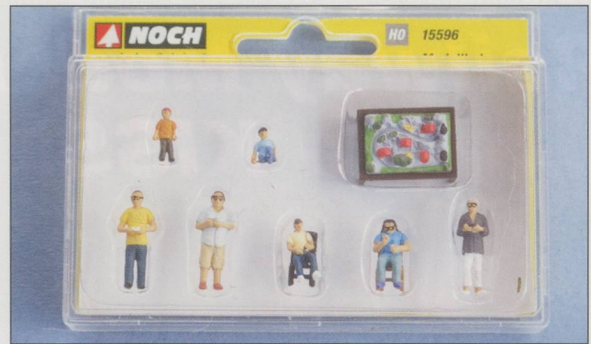
Railway modellers by Noch!

Noch is well known for producing a large range of figures for modellers in all of the popular scales but these two packs are a little different. One is a set of railway modellers and the other is of Swiss station personnel, one of whom carries an illuminated train despatch disc. There are seven railway modelling figures including two children. Four of the figures are wearing glasses and three of them are holding controllers.