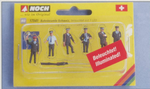
Swiss station personnel by Noch.