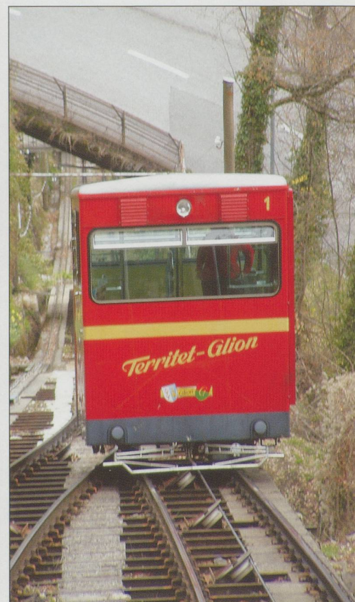
ABOVE: An original car is preserved at the lower terminus. RIGHT: Territet-Glion at the half way passing point.