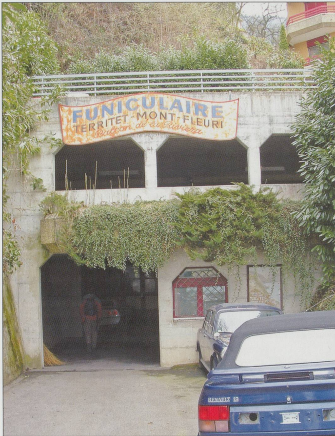
Territet entrance of Mont Fleuri Funicular on 31/3/2005.

removed at the time to keep it secure, other parts of the infrastructure have 'disappeared' over the years.