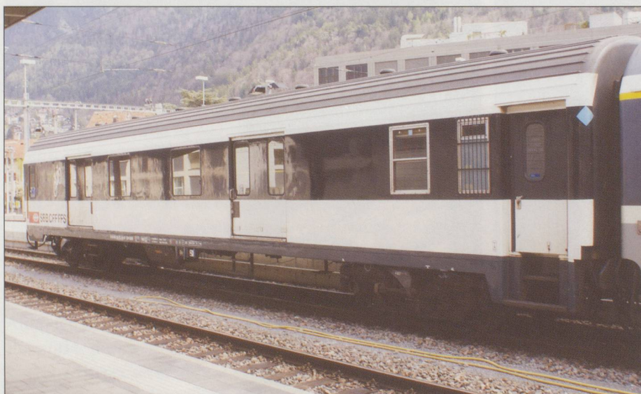
SBB ex-SNCF Fourgon in Chur on Basel train 2007