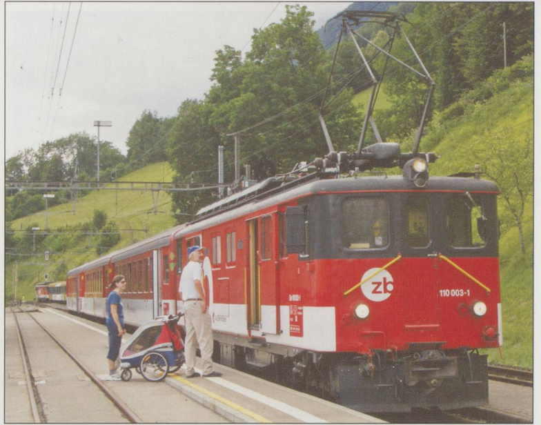
Zentralfbahn, Oberried, 2013, using a redundant baggage compartment to help a passenger with a bike and trailer.