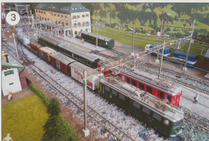
1. Ge6/6 II No.707 'Scuol' and Ge6/6 II No.414 with stock in the carriage sidings; industrial plant to the left. 2. The station building at Sta. Maria. 3. ABe4/4 No.502 and Ge6/6 II No.702 'Curia' await departure time at Sta. Maria with a local and a freight respectively. 4. Ge4/4 I No.601 'Albula' with a short freight mid-way between Valcava and Sta. Maria.