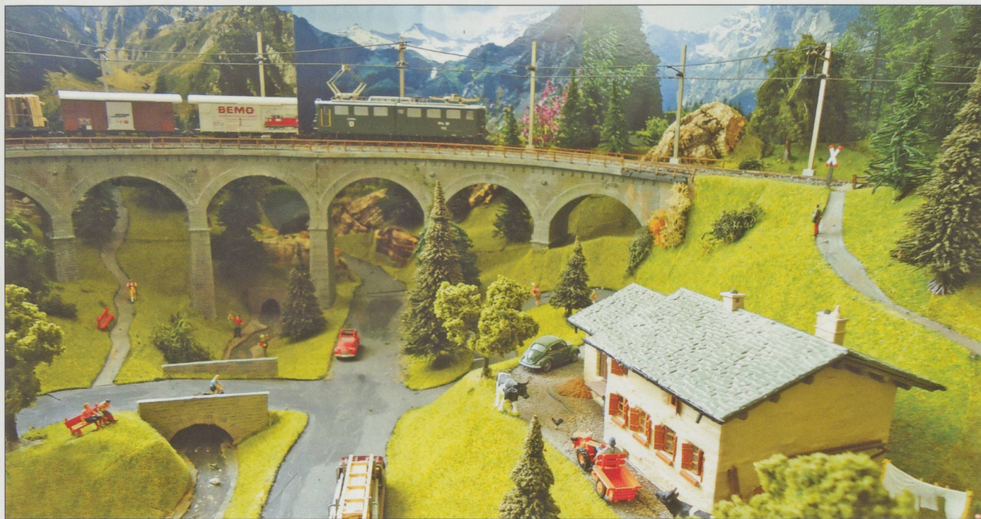
Ge6/6II No.702 'Curia' on the viaduct outside Valcava. Fishermen pay no attention but a photographer is in place to record the train.