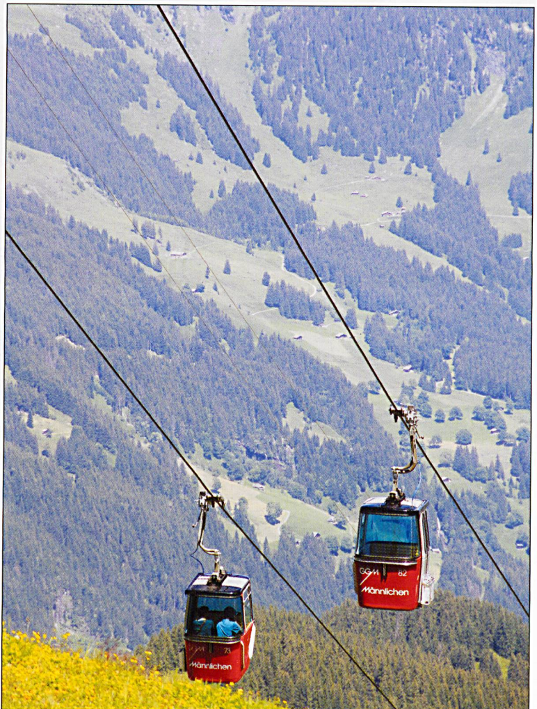
TOP: The new passing loop between Wengen and Allmend.