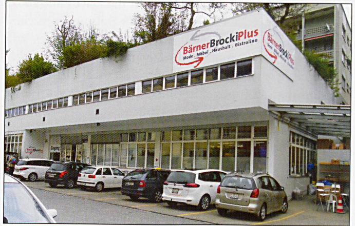
The BärnerBrocki store in Bern.

coffee with freshly baked home-made cakes, and has toys for the kids to play with.