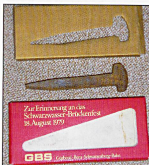
A railway rarities find.