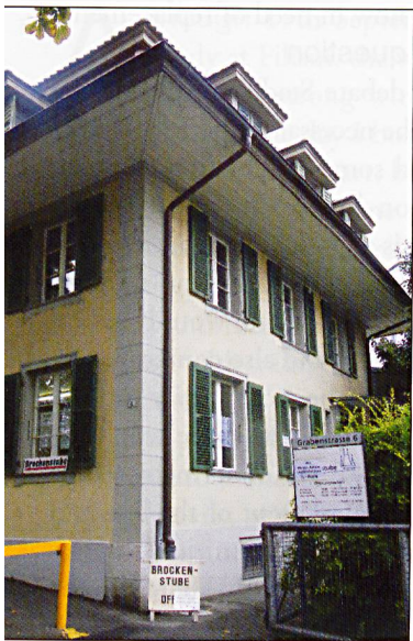
The Brockenstube Frauenverein in Thun.

This store is run by the Women's Association, which was founded in 1876 and is a non-profit organization; they support social projects, institutions and disadvantaged people. We discovered this Brocki by accident while heading to the HIOB in Thun, and it is probably what a store would look like if the Women's Institute in England ran it. It is at Grabenstrasse 6 and is housed in what seems to have once been a residential flat, so has small rooms of goods for sale, all at excellent prices. Finding a brand new SBB mug here for 50c pleased my husband. The ladies who work here are always very smartly dressed, helpful and friendly - and seem rather posh! It is open on Tuesday, Wednesday and Thursday from 09.00-11.00 & 14.00-17.00 and on Saturday from 10.00 to 12.00.