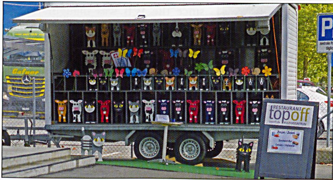
The large selection of garden planters on sale at the Bodeli Brocki.

health issues; disabilities and special needs, who are often working in the store as they are helped into work in the private sector. They also offer a wide range of handmade wooden items such as toys, and the novelty garden planters often seen in Swiss gardens. It opens from 09.00-18.00 during the week but closes at 16.00 on Saturdays.