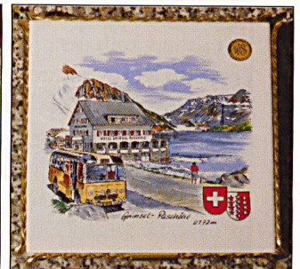
A Gimsel Pass souvenir.