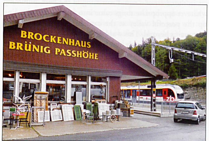
Sometimes bargains can be spotted from the train window – well worth a visit.

You may have noticed this Aladdin's Cave on the Zentralbahn's Brünig Hasliberg station. This store buys antiques and new or used goods of all kinds. Unusually for Switzerland this store opens from 09.00-1800, 7-days-a-week, and also holds monthly Sunday flea markets (floh markt). The prices here are slightly more expensive as the range of goods is more 'antiquey'. In 2015 there were numerous heavily discounted souvenirs here from the Grimsel Pass which, en mases, really demonstrates the skill the Swiss have of making every conceivable item into a souvenir. We assumed that a souvenir store on the Pass had recently closed down! This makes a good break on the splendid rail trip from Interlaken to Luzern.