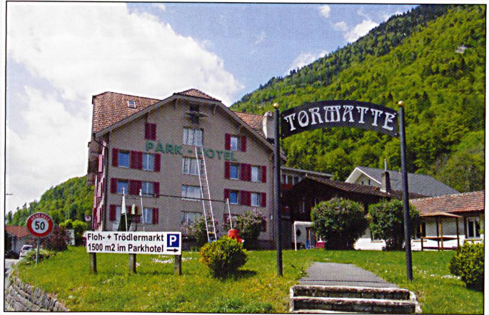
Not quite what it would appear. No longer the Park Hotel hotel, now a Flea market away from the commercialism of Interlaken's main streets.

badges. It is open every afternoon from 13.30, and additionally on Saturday mornings.