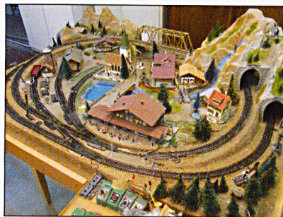
You might even find a model railway.