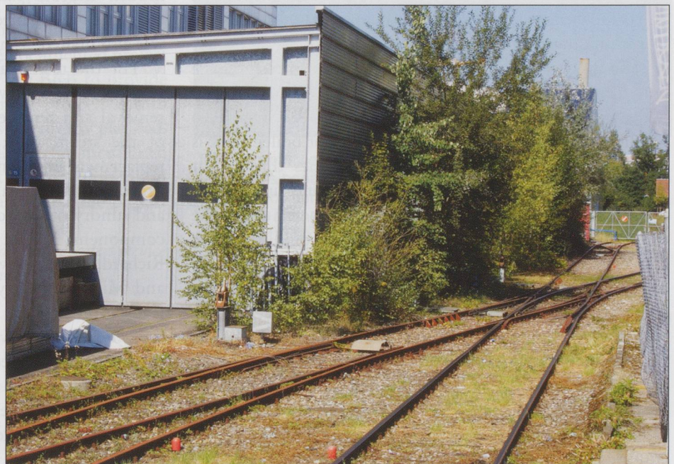
The end of the old line at Tram Depot gate.

There is, however, a last tantalising relic. Between Wankdorf and the elevated section of the SBB line into Bern, where the original temporary Wylerfeld terminus must have been, there is on the east side of an over bridge, another typical wooden SCB section house. It is almost a ruin, but unmistakeable. It must date from 1857 and seems to have survived everything since. +