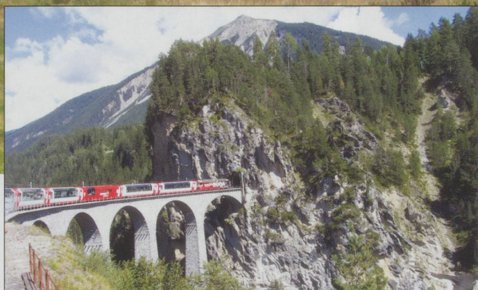
ABOVE LEFT: RhB Ge 4/4 III crosses the Landwasser Viaduct with a Glacier Express, 02/08/2015.