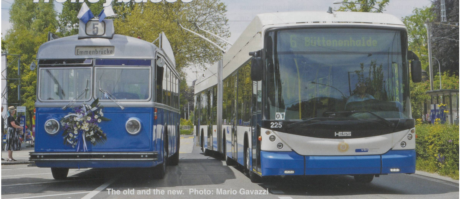
The old and the new.