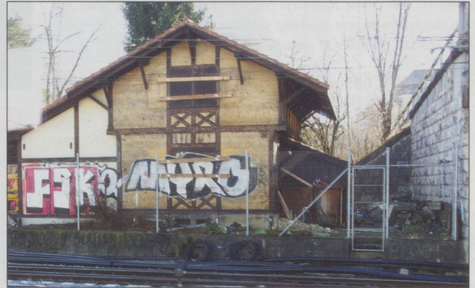
Wylerfeld SCB Haus, Bern, 27.12.2015.

Swiss Express is good at being the first, but this time we were the last. The reference on P7 of the June magazine, at the end of the Bern/Ostermündigen article, to a SCB Section House of 1857 at Wylerfeld is no longer valid, as the building was demolished (it didn't need much) during April, as part of the widening works now in progress. A picture of the house just beforehand is attached. There are others; look out on the east side of the line north of Sissach to see one from 1855 in good condition.