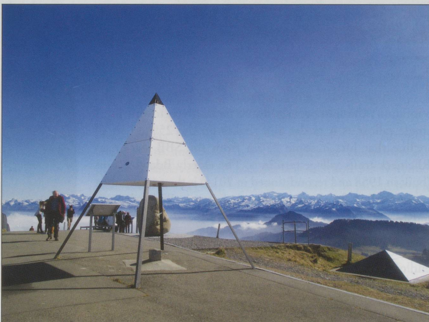
TOP: Walkers set off from the summit station. BELOW: The magnificent view from Rigi Kulm.