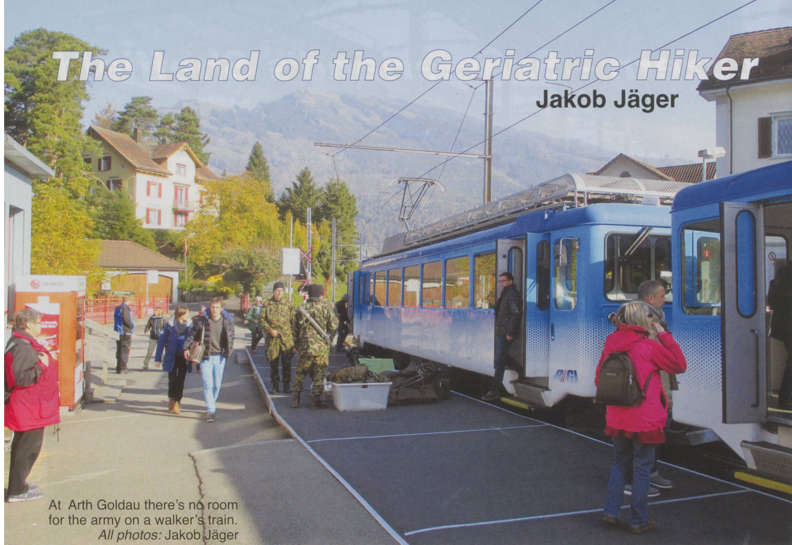
At Arth Goldau there's no room for the army on a walker's train.

It is 9am at Zürich Hauptbahnhof on a crisp autumn mid-week morning. Suburban and longer distance trains roll in to its numerous platforms as commuters disembark in droves and head out into the city centre. Railway staff quickly turn-around the trains, preparing them for the next service, but already people are waiting on the platforms to board. These are a different type of passenger. Most appear retired; most carry small rucksacks; many have folding hiking sticks; all are wearing sensible footwear. These are residents of the city heading out to use the 62,000km of Wanderwege that cover the Swiss countryside – an intricate spider's web of signed footways. Over one-third of Swiss adults claim to be a 'Wanderer' and due to having more of that precious