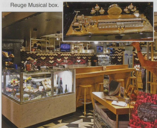
Reuge Musical box.

Next time you're visiting the sights of London, and you've watched The Swiss Glockenspiel in Leicester square (performs Mon - Fri for up to five minutes commencing at 12 noon, 5pm, 6pm, 7pm and 8pm, and also on Sat, Sun and public holidays at 2pm, 3pm and 4pm), why not make the obligatory visit to Harrods? Once you've fought your way through the tourists on the ground floor, find the lifts or escalators and make your way to the third floor. Here you can find refreshments in the Montreux Jazz Festival café , and if that £70K+ is weighing heavily in your wallet, you could always buy a Swiss Reuge musical box! If you can't afford it, you can always ask to hear it, demonstrated by one of the helpful staff (wearing white gloves!) ☐