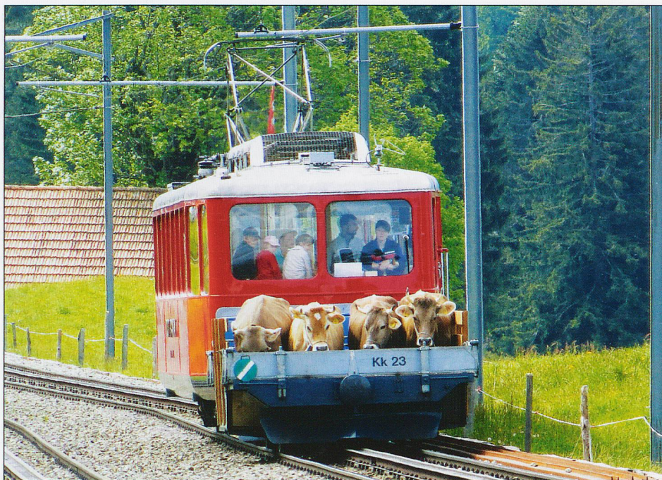
Cows in Transit. They are obviously used to the ride.

Berggnuss. This is the latest venture, and needs a little explanation. First of all, the name is just about unpronounceable to English or French speakers. This is deliberate. Going back to the second strand of the