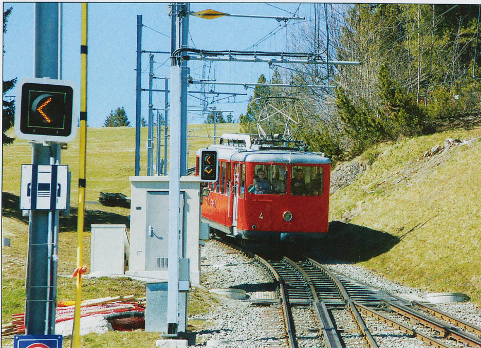
Bhe2/4 No.4 (ex.VRB 1954) descending to Kaltbad.