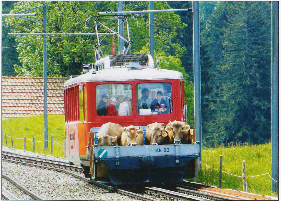
Cows in Transit. They are obviously used to the ride.

Berggnuss. This is the latest venture, and needs a little explanation. First of all, the name is just about unpronounceable to English or French speakers. This is deliberate. Going back to the second strand of the