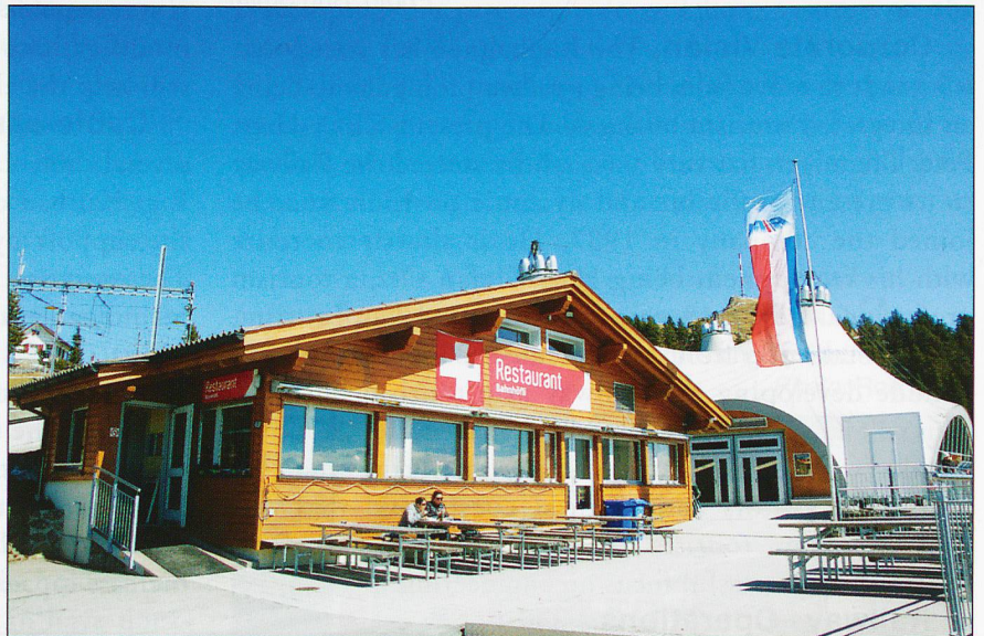
Bahnhöfli at Rigi Staffel.