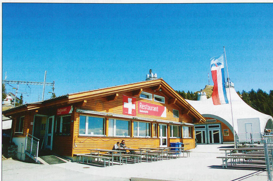
Bahnhofli at Rigi Staffel.