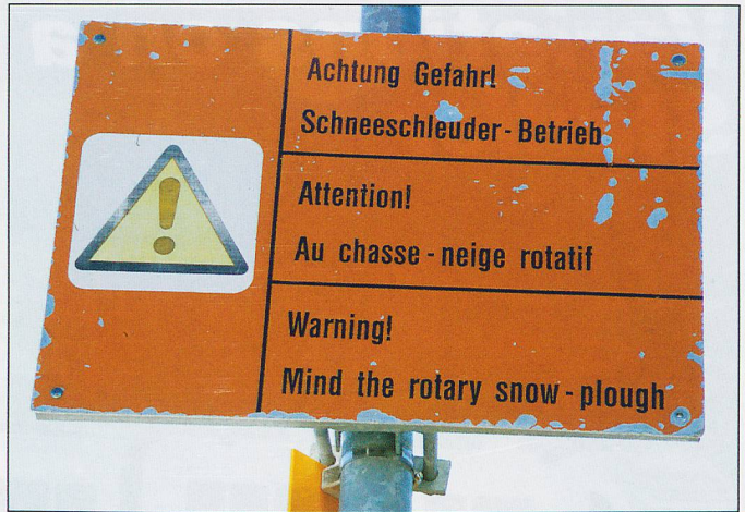
Unusual warning sign at Staffel.

Commercial operations. 2015 was another record year for the Rigibahnen with some 785,000 passengers being carried, and in the 12 months up to end-July 2016 they reached the magic 1m passengers. The busiest single day was in July when 8,000 people travelled to and from the Swiss Wrestling Championships at Staffel. Good weather brought an increase in the core Swiss passenger market, although early-2016 had seen a slight fall in the numbers of Asian visitors. The acceptance of the Swiss Travel Pass has greatly helped too, and in the 5 years since it was introduced on the Rigi system it has been used by an increasing number of passengers. The Rigi and Rigibahnen are the only mountain and railway that are open to Swiss Pass holders 365 days a year. The increases in passengers can have unexpected consequences. For example, it is not unusual to have two bus loads of tourists arrive at Vitznau, say from Milan, and of course many need to use the toilet before boarding the train. The toilets in the 1913 ship-station building cannot cope with this influx, and this can result in unacceptable delays to the train setting off up the mountain. Temporary toilets have been installed and a