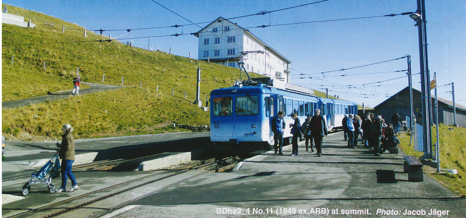
BDhe2_4 No.11 (1949 ex.ARB) at summit.

T he Rigibahnen, serving its eponymous mountain massive in Central Switzerland, has a long and successful history. It started as Europe's first rack railway and over the years it has developed many strands to its business.