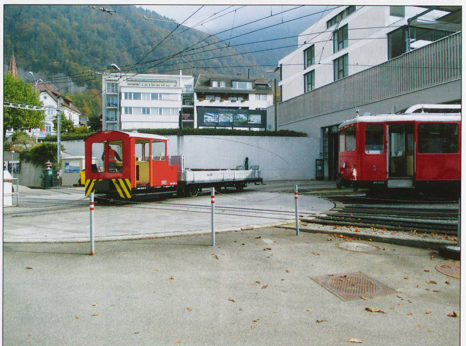
Ta2/2 No.1 (ex.VRB 1982) battery-electric shunts at Vitznau.

Cable-car operations. The Rigibahnen operates several cable-car routes – the main one is from Weggis to Rigi Kaltbad operated with two large gondola cars, but the support pylons need renewal, a serious investment. The operation is normally suspended each April for major maintenance and annual testing. The present system has a capacity of 75 people/car, standing only, that equates to 650 people/hour. To replace this with a similar system would be the cheapest option at approx. CHF17m but this would not enhance the capacity. The large cars could be replaced with a continuous operation of twenty smaller ones, each with a capacity of 10 people seated. This would increase capacity to around 800 people/hour, and with an