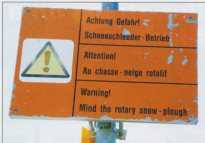
Unusual warning sign at Staffel.

Commercial operations. 2015 was another record year for the Rigibahnen with some 785,000 passengers being carried, and in the 12 months up to end-July 2016 they reached the magic 1m passengers. The busiest single day was in July when 8,000 people travelled to and from the Swiss Wrestling Championships at Staffel. Good weather brought an increase in the core Swiss passenger market, although early-2016 had seen a slight fall in the numbers of Asian visitors. The acceptance of the Swiss Travel Pass has greatly helped too, and in the 5 years since it was introduced on the Rigi system it has been used by an increasing number of passengers. The Rigi and Rigibahnen are the only mountain and railway that are open to Swiss Pass holders 365 days a year. The increases in passengers can have unexpected consequences. For example, it is not unusual to have two bus loads of tourists arrive at Vitznau, say from Milan, and of course many need to use the toilet before boarding the train. The toilets in the 1913 ship-station building cannot cope with this influx, and this can result in unacceptable delays to the train setting off up the mountain. Temporary toilets have been installed and a