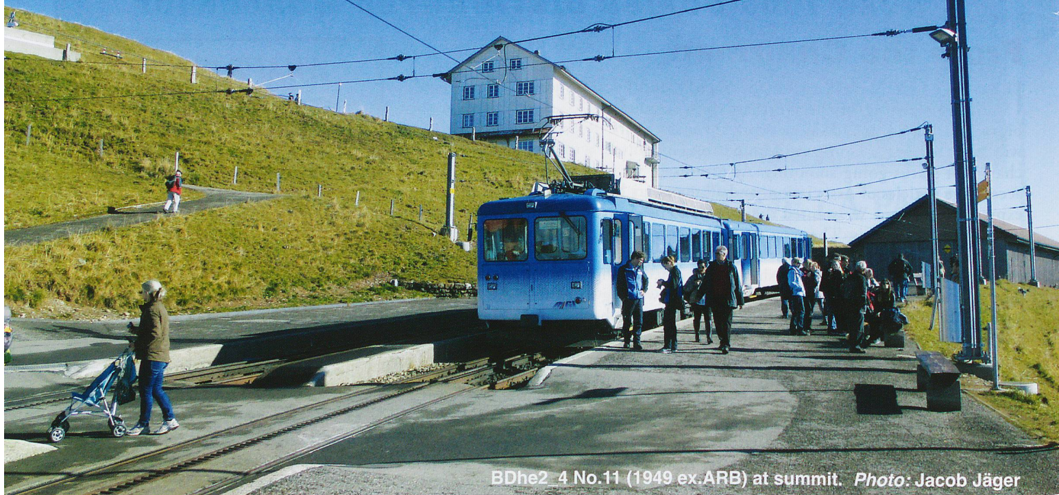
BDhe2_4 No.11 (1949 ex.ARB) at summit.

The Rigi Bahnen, serving its eponymous mountain massive in Central Switzerland, has a long and successful history. It started as Europe's first rack railway and over the years it has developed many strands to its business.